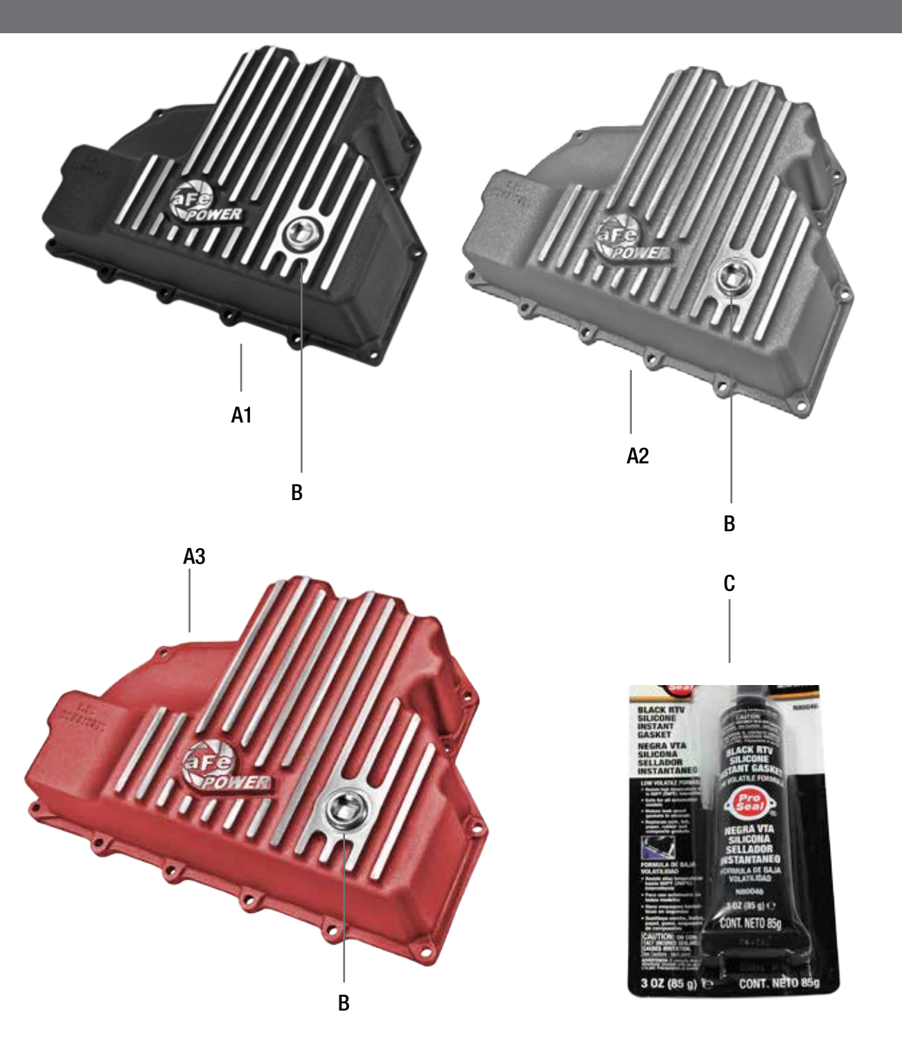
Page 3 aFepower.com