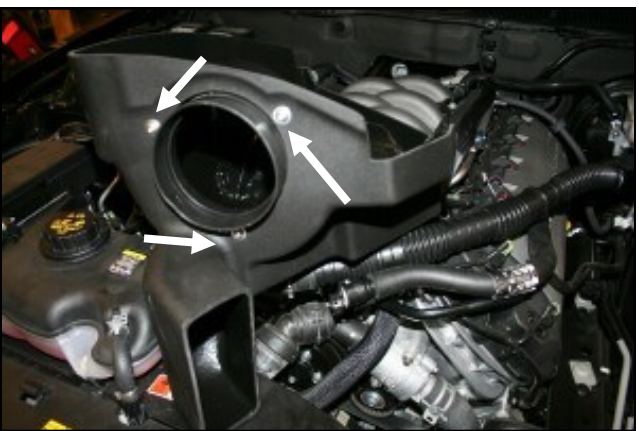
bolts, and flat washers into the Airaid Cool Air Box (CAB) as shown.

equipped vehicles will also use the 3/8" Fitting and 3/8" Grommet. Manual transmission vehicles will not need the 3/8" components and will use the Blind Grommet.