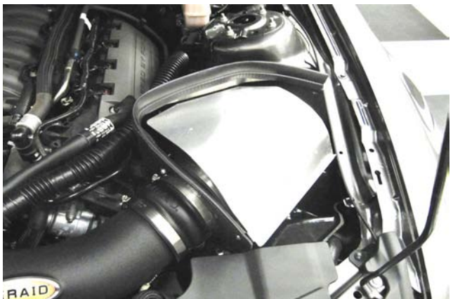
13. Reconnect the Mass Air Flow sensor, which is now 14. Mount the Rain Shield onto the Airbox as shown 15. Install the Weather Strip onto the CAB with the con-