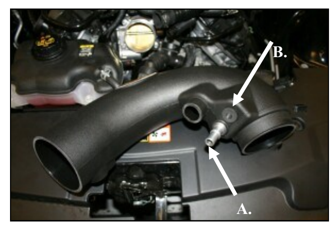
4. Install the Grommets and Fittings into the Airaid intake 5. Using the supplied Torx driver, remove the MAF sen- 6. Install the filter adapter using three 1/4-20 button head tube. A) All models will require the use of the 5/8" Fit- sor from the Factory airbox and create the Tube assemting and the 5/8"Grommet. B) Automatic transmission bly.

3. A) Slide the red tab, and disconnect the wiring harness from the Mass Air Flow sensor (MAF). Carefully pry the harness anchor from the air box using a screwdriver. B) Separate the resonator tube from the stand off attached to the Air box lid. C) Using a 10mm socket, remove the bolt securing the air box to the inner fender and remove the air box assembly. This bolt will be reused in