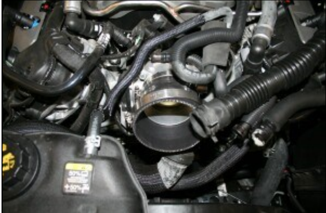
10. Install the Reducer and Hose clamps onto the throttle body. Place the #56 clamp on the Throttle body side of the reducer, and the #64 clamp on to the tube side.