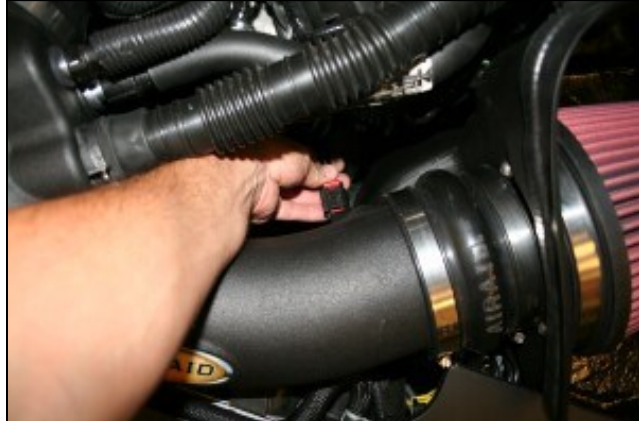
located in the lower back side of the intake. Slide the locking tab back into the connector.