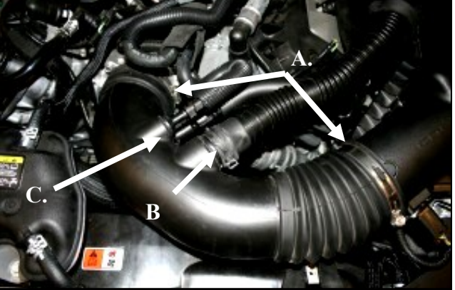
2. A) Loosen the hose clamps on the factory intake tube B ) Squeeze the clamp and disconnect the resonator from the air intake tube. C) Carefully depress the hose lock tabs, and disconnect the crank case breather line and the brake aspirator line (if equipped, AT models only). D) Remove the factory intake tube.