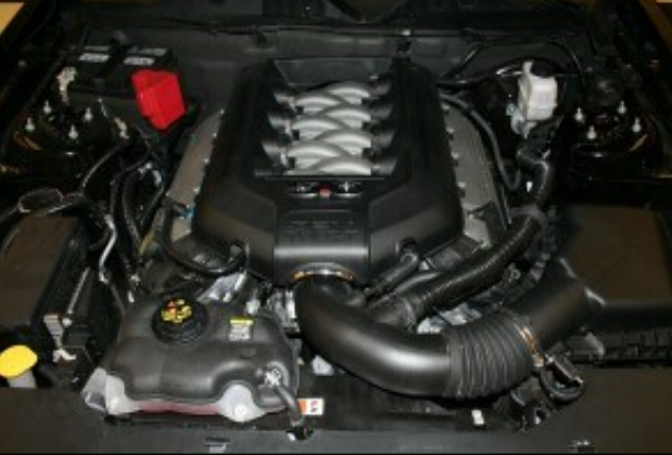
Disconnect The Negative Battery Terminal! 1. Remove the Engine cover by simply lifting up, and set aside.