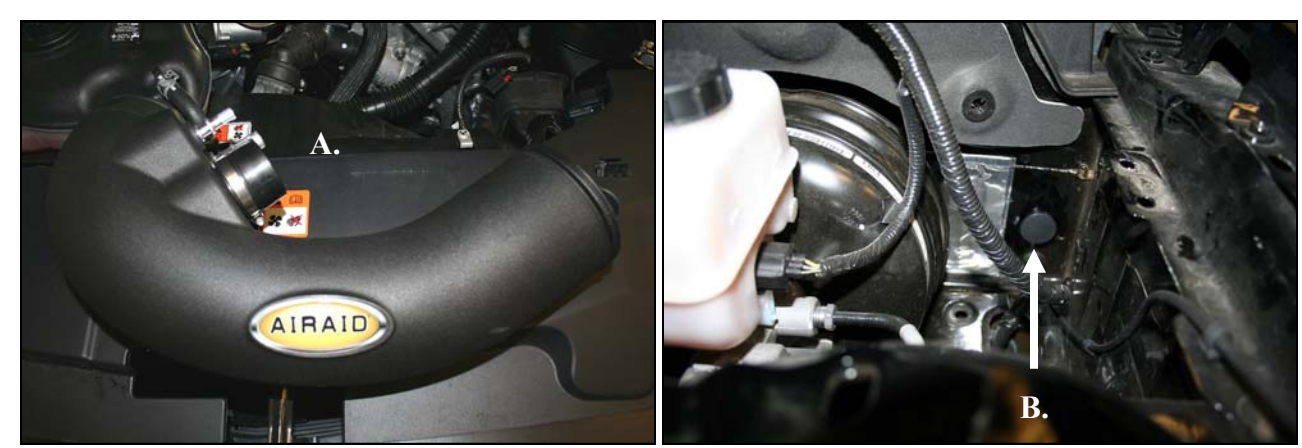
Full Color instruction can be viewed on our web site at Airaid.com. Use the Product Search function to find your part number, and click View Details.

B.) Snap the Firewall plug into the firewall hole.