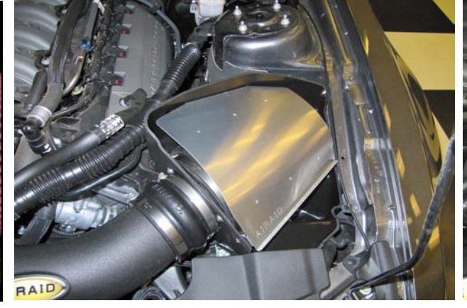
using the 1/4-20 Button Head Screws and Washers. toured edge going away from the filter. Start at the front NOTE: Installation of the Rain Shield is optional but of the vehicle and work your way back. Replace the enhighly recommended for vehicles with Power Dome gine cover. hoods with heat extractors.