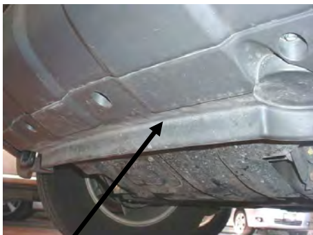
PLASTIC AIR DAM