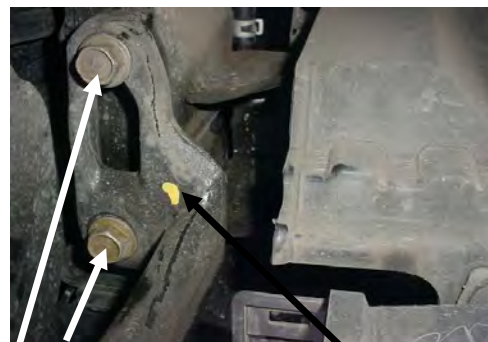
REMOVE THIS BOLTS