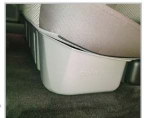
This is how the DU-HA should look installed under the back seat.