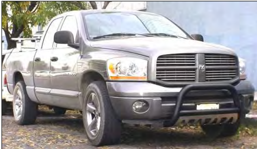
DAKAR / DAKAR SPORT INSTALLED