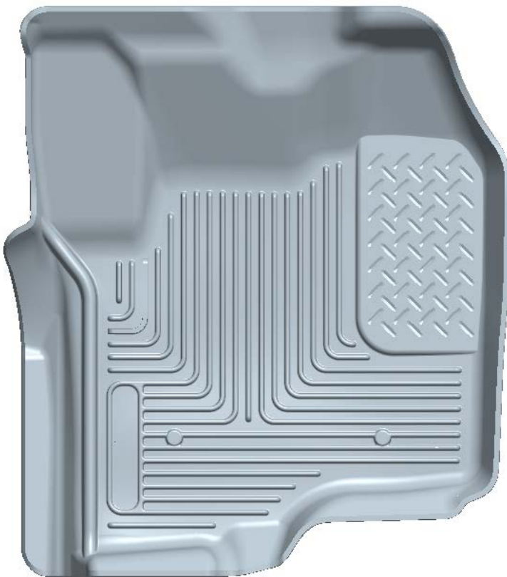
LEFT OR DRIVER

Your liners are made from an engineering resin that is lightweight and extremely tough and durable. The easiest way to clean your liners is with a damp cloth or sponge and soap and water. Windex®, 409® and ArmorAll® type cleaners work as well.