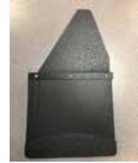
Kick Back Mud Flap Passenger's Side (1)