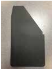
Universal Mud Flap Driver's Side (1)