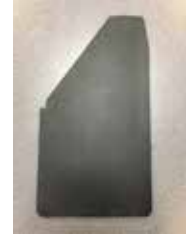
Universal Mud Flap Passenger's Side (1)