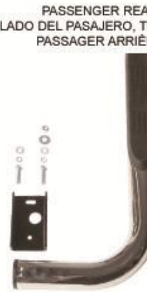
PASSENGER REAR - LADO DEL PASAJERO, TRASERO - PASSAGER ARRIÈRE -