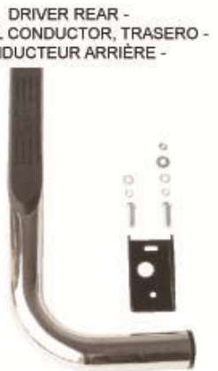
DRIVER REAR - LADO DEL CONDUCTOR, TRASERO - CONDUCTEUR ARRIÈRE -