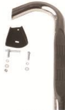
PASSENGER FRONT - LADO DEL PASAJERO, DELANTERO - PASSAGER AVANT -