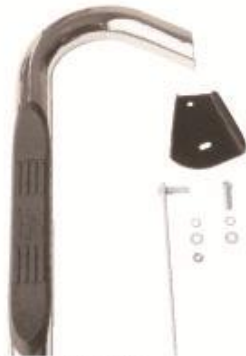
DRIVER FRONT - LADO DEL CONDUCTOR, DELANTERO - CONDUCTEUR AVANT -