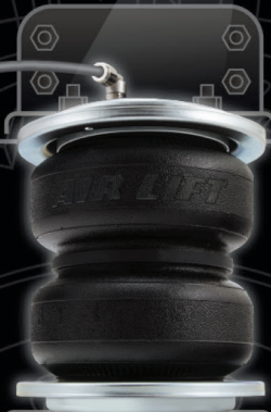
Raise and lower your suspension to the perfect level — while also providing the extra support your truck needs.