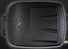
On-board air compressor

If you don't know Air Lift, You know squat.