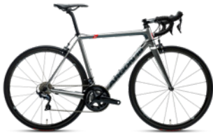
SILVER GREY METALLIC

WANNA RACE? Why not. The Gallium is anything but a wannabe race machine. Build it right, put on your race wheels and get ready to tackle any race circuit, from the local criterium to world-class mountain stages. The Gallium will take you to the finish line like a pro.