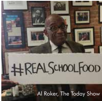
Al Roker, The Today Show