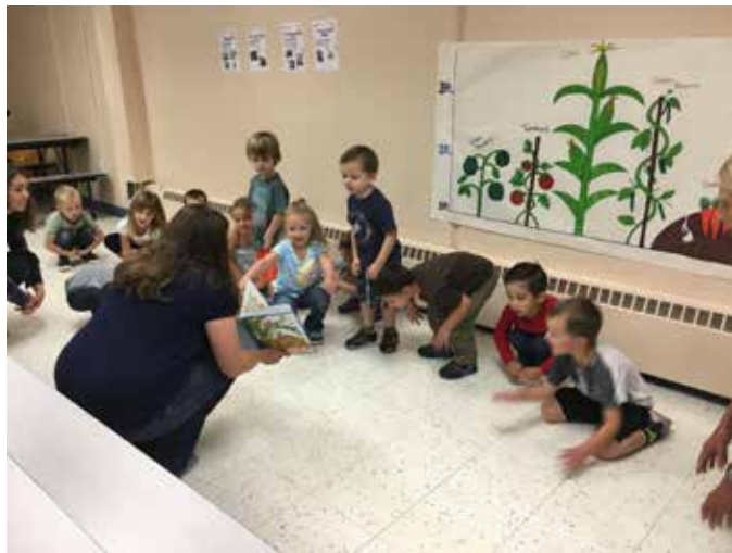
Pre-schoolers learning how vegetables grow through the book "Up, Down, and Around"

Project Produce launched in 2014 in partnership with Healthy Skoop, and supports the purchase of fresh fruits and vegetables for school-wide nutrition education activities.