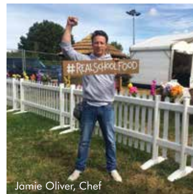
Jamie Oliver, Chef