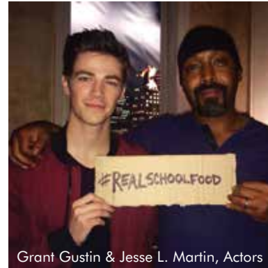
Grant Gustin & Jesse L. Martin, Actors