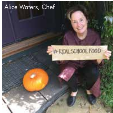
Alice Waters, Chef