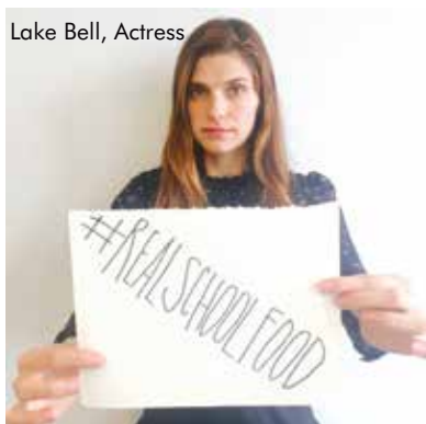
Lake Bell, Actress