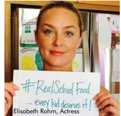
Elisabeth Rohm, Actress