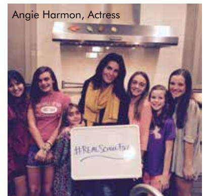
Angie Harmon, Actress

Will you support #RealSchoolFood in 2016?