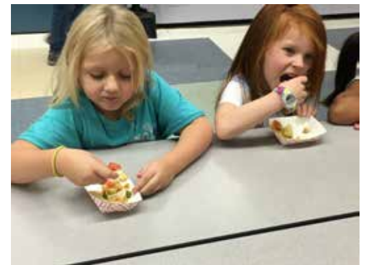
Kids enjoying the fruits of their labor: a delicious Chickpea Pico de Gallo!