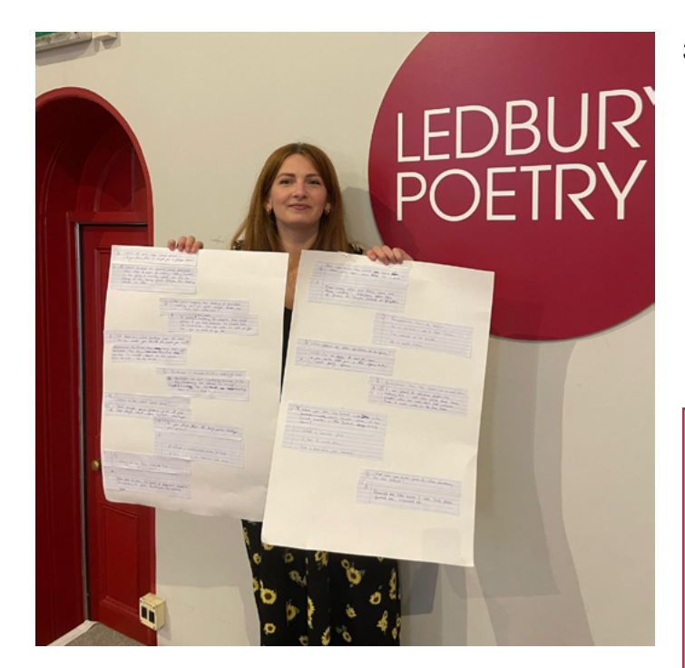
Feeling Towns: Poetry from Ledbury; photo credit: Feeling Towns team.

For example, the Feeling Towns KE Project has hosted a series of discussions between heritage practitioners (Historic England) and policy makers (Department of Levelling Up, Housing and Communities) about the existing, largely quantitative, metrics and proxies for measuring pride in place. The project is advancing understandings of how to approach pride in place and complicating notions of what pride is. They are achieving this through adopting a range of creative methods, including poetry and emoji mapping and working with people on the meanings and felt experiences associated with local places in Hereford, Darlington and Southampton. In so doing, Feeling Towns have moved beyond a simplistic and uncontested definition of pride that can be quantified in numerical terms and towards a rich account of the multi-layered fluidity of pride in place.