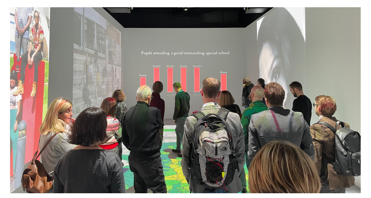
City Change through Culture: Walking Through Coventry Data; photo credit: Si Chun Lam.