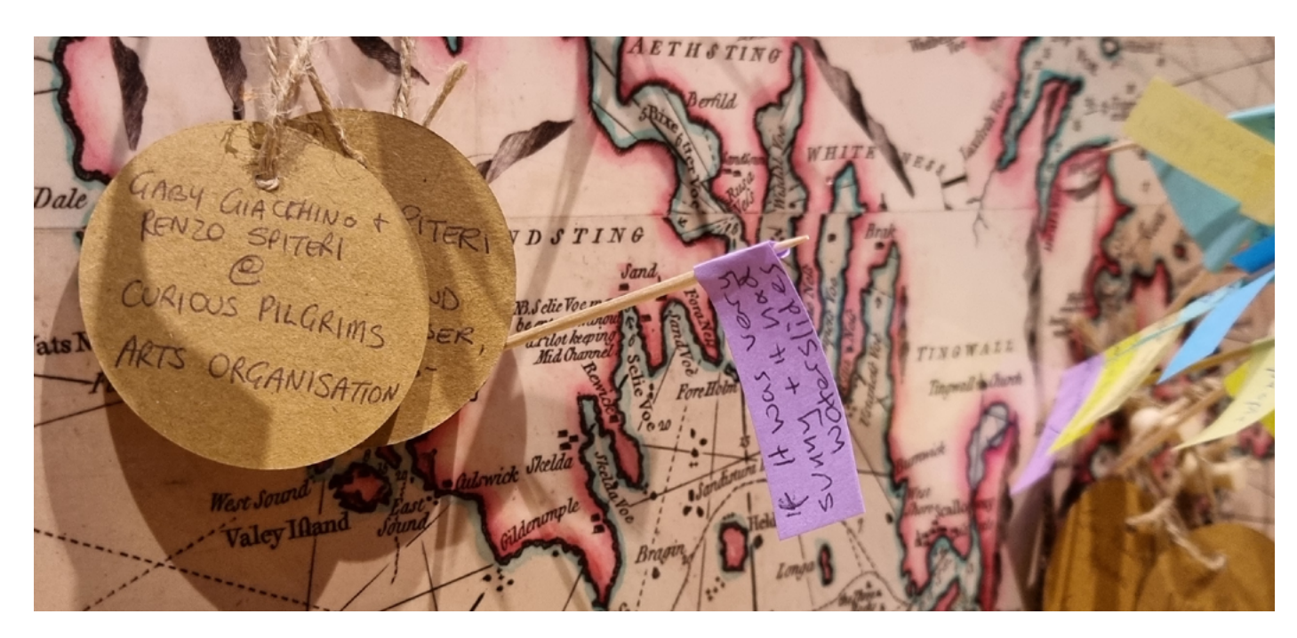
Resonance: Final Knowledge Exchange Event at Shetland Arts Development Agency: Mapping cultural assets; photo credit: Zoë Prosser.

Place-based work can and does span different geographic areas and scales. Indeed, the majority of the KE Projects worked with people in multiple locations. Key to working across multiple locations is isolating what works in place and what could