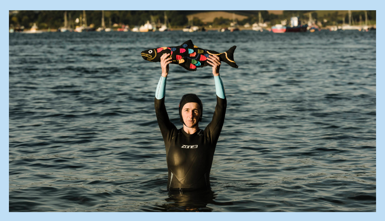
Creative Peninsula 'Salmon Run' – 25 September 2022, performance at a site along the River Exe, led by Tidelines; photo credit: Jenny Steer.

For example, the Creative Peninsula project is re-telling stories and surfacing new stories of place that showcase the multiple meanings that exist across the far South West of England. By working in partnership with academic researchers, arts organisations, creative practitioners, and local authorities across the region, multiple stories and meanings of place are emerging. Key thematic areas include Outdoor Cultures, Queer Peninsula, Atlantica/Black Atlantic, Intergenerational Ruralities, and A Parliament of Waters.