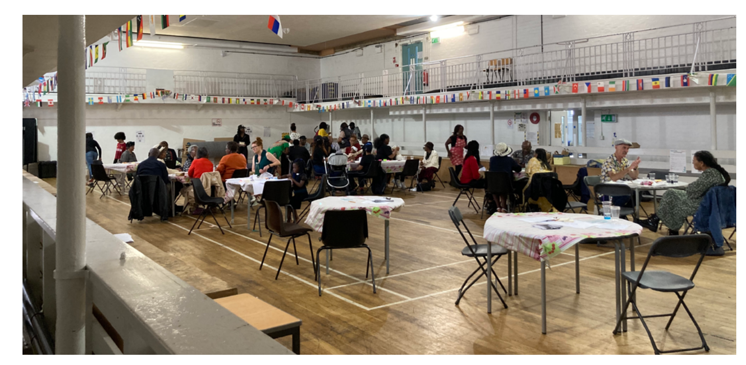
Roots and Futures: Consultation and cook out at Park Library, Sheffield, attended by over 100 people from the local African and Caribbean community; photo credit: Roots and Futures Project.

For example, the Roots and Futures project in Sheffield demonstrates the significance of the past in building a sense of belonging, rooted in a shared sense of place at the neighbourhood scale. At a city-level, Sheffield's reliance on white, northern heritage narratives has created barriers to members of other communities engaging with traditional heritage-focused spaces and activities. The Roots and Futures project used participatory action research methods to work with Sheffield's diverse communities to ensure that the multiple memories, meanings, and stories of Sheffield's past were heard as the city developed its Heritage Strategy. The perspectives of more than 500 people from communities underserved by heritage policy are included in a Community Voices booklet that communicates the needs of marginalised communities and their priorities for the heritage sector to address.