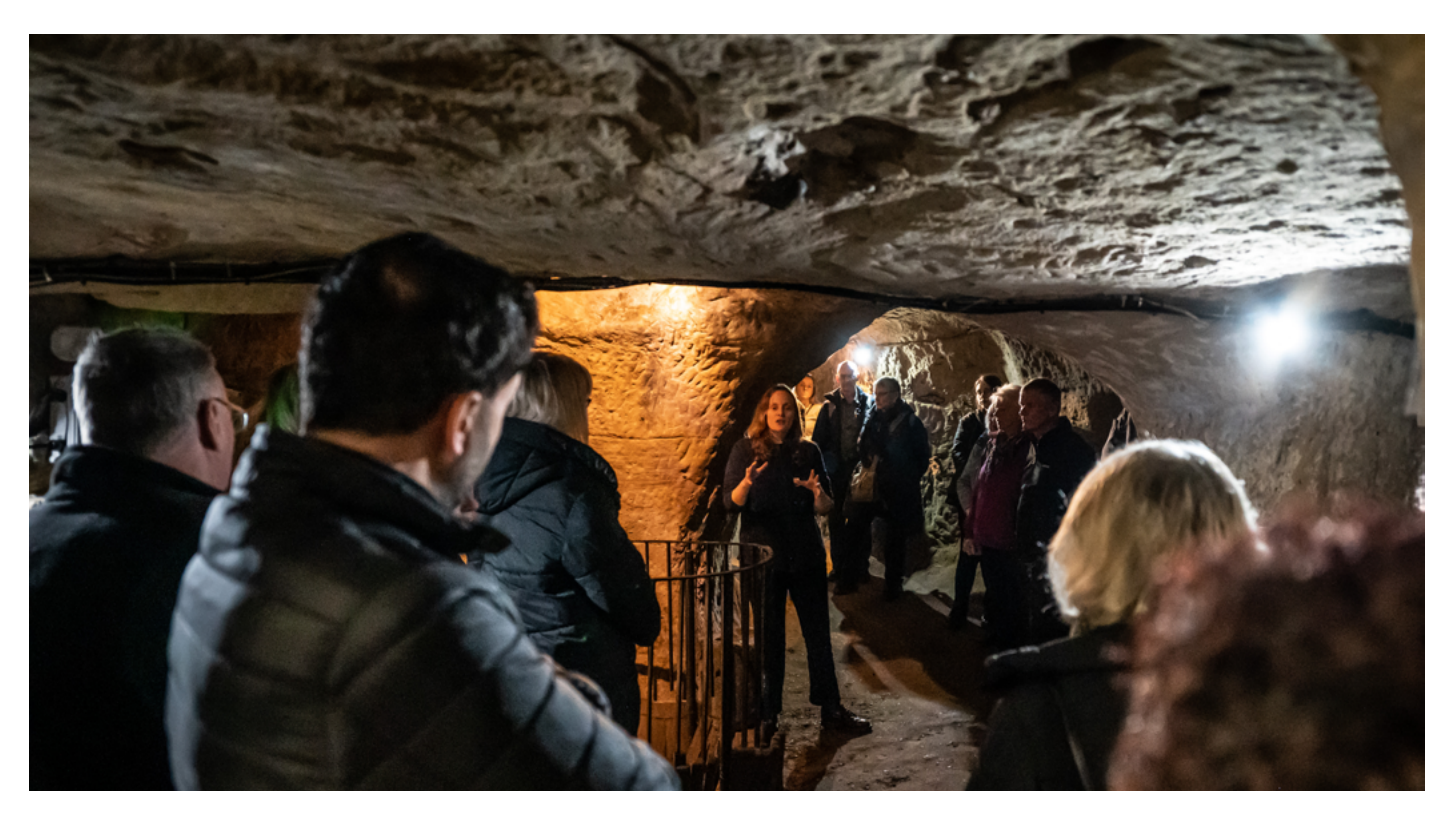
City of Caves: Tour of the cave system during the 2022 Being Human Festival; photo credit: University of Nottingham.

Projects such as People, Heritage and Place show how arts and humanities research can help meet a wide range of change management needs, from condition surveys of historic buildings in the Saltaire World Heritage site to aiding simulations with the use of the 'digital twin' of how future transport strategies might affect air quality. Community involvement is fostered through close collaboration with local schools on creative learning, communityinterest groups, businesses, residents and newcomers to the city, and the development of a digital 3D representation of Saltaire. Work developing the model has increased knowledge of Saltaire and will offer efficiencies in monitoring the condition and fabric of the site. In so doing, the project recognises that people of all ages ascribe meanings to place, as well as recognising that the change management strategy will enable new meanings to be created over time.