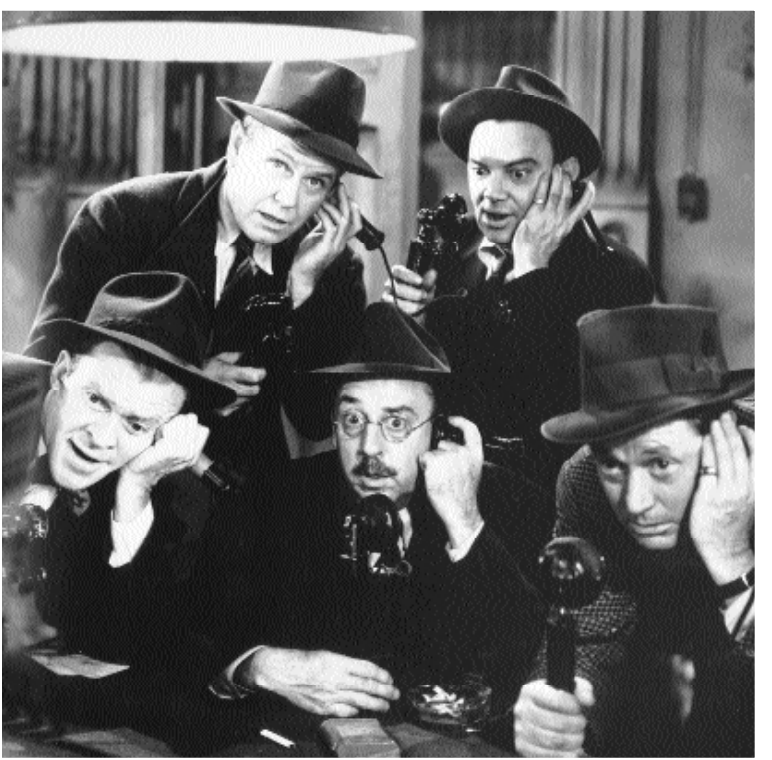
HIS GIRL FRIDAY. Sikov, Ed. Screwball. New York: Crown Publishers. 1989. p. 156.

sums up Room Service and all of its fellow farces of the thirties: "The actors work with a will –; they rush about the stage as if panic had stricken them; they blurt out their wild bits of dialogue as if under pneumatic pressure; they shout, gesticulate, play tricks, gambol with the irresponsible abandon of an amiable lunatic asylum let loose; they give us no time to think, to analyze or to criticize; somehow they laugh and will make us respond!"