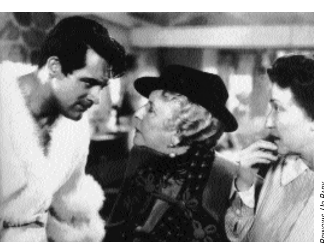
Вятыты UP Влау. Sikov, Ed. Screwball. New York: Crown Publishers. 1989. p. 103.

A slapstick is literally a kind of paddle split down the middle so that two halves come together with a sharp noise when used to strike someone. But slapstick has become the essence of farce itself-exaggerated noise and effect, but no real pain. It's a symbol for a basic, impulsive human response-hitting. The acrobatic tricks of the commedia zannis, which were exhibited for skill alone, were still slapstick. Today it has become falls: out of chairs, over sofas, through windows; trips: over rugs or our own feet. The essential physical function is the same but transferred to a modern environment. In the farce of the silent movies and mid-twentieth century comedy, horseplay includes automobile chases, conveyer belts, electrical equipment-all the "slapsticks" of a modern technological society that goes berserk or drives us crazy through our inability to control them. At this moment, the computer is the ultimate authority figure that frustrates and infuriates.