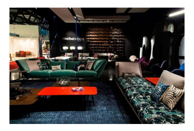
B&B Italia, FLOS, MOOOI, Kartell, and <u>Roche Bobois</u>, pictured here, are among the many large companies that roll out incredible installations. The color of that wonderful ATMOS green velvet sofa is so rich and so new-feeling.