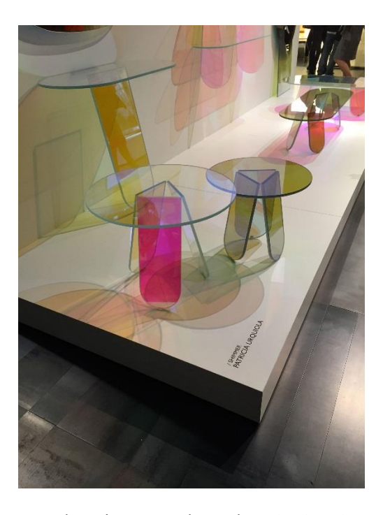
Patricia Urquiola's Shimmer tables stopped me in my tracks at the <u>Glas</u> booth. Transparency continues in poetic new ways.