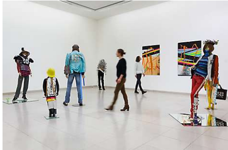
Schauspieler II, 2014, by Isa Genzken

From beginners to aficionados, Art Basel Hong Kong has something for everyone. The art fair is held over three days this month (24 to 26 March) and is Hong Kong's biggest – single-handedly transforming the city into a dizzying celebration of all things creative.