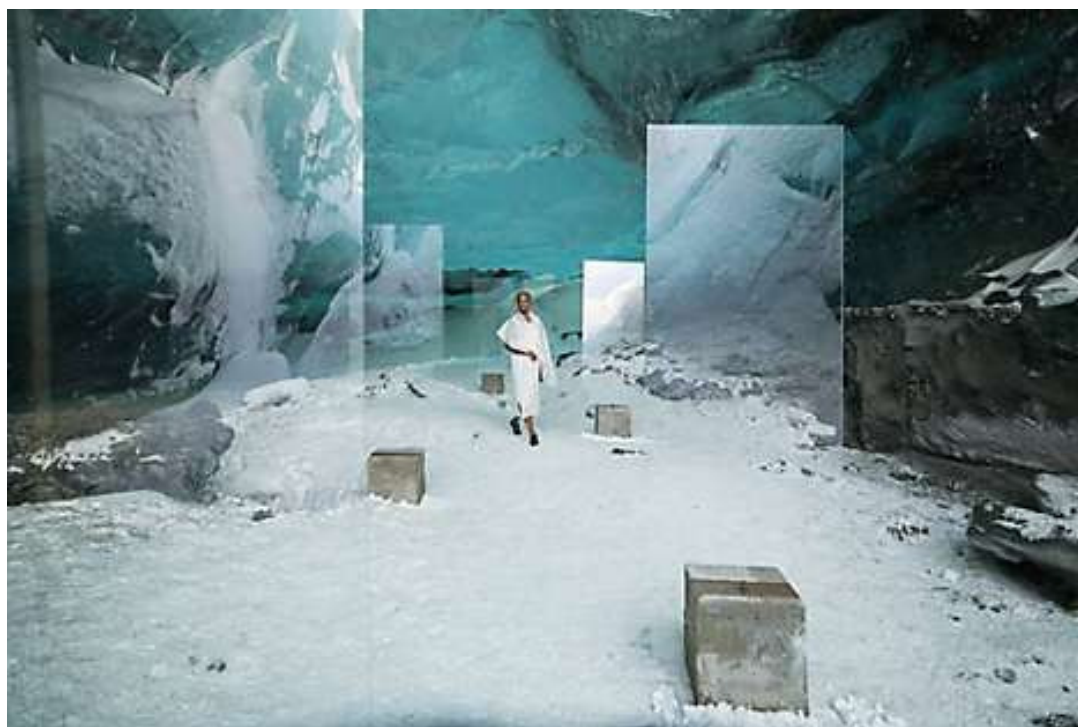
Stones Against Diamonds by Isaac Julien