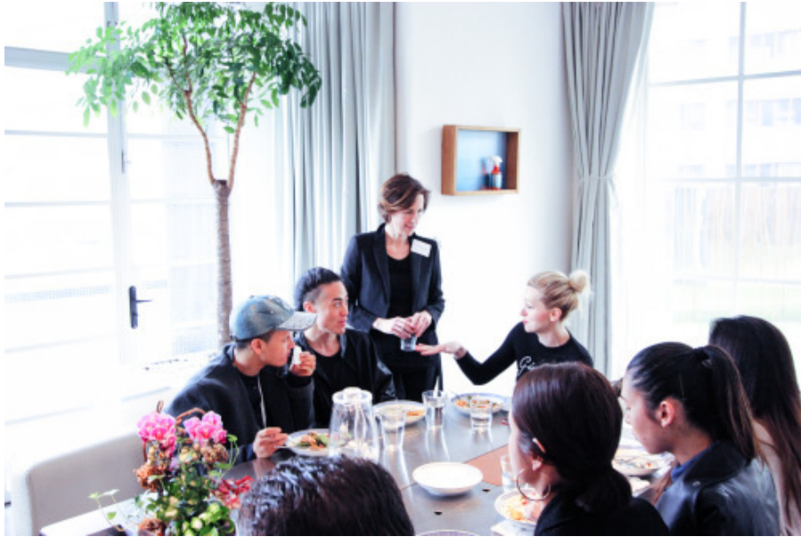
Lunch with Press at Spring Wokshop