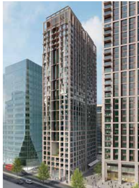
Three Casson Square / Patel Taylor Architects ثلاثة كاسون سكوير / باتل تايلور للهندسة المعمارية