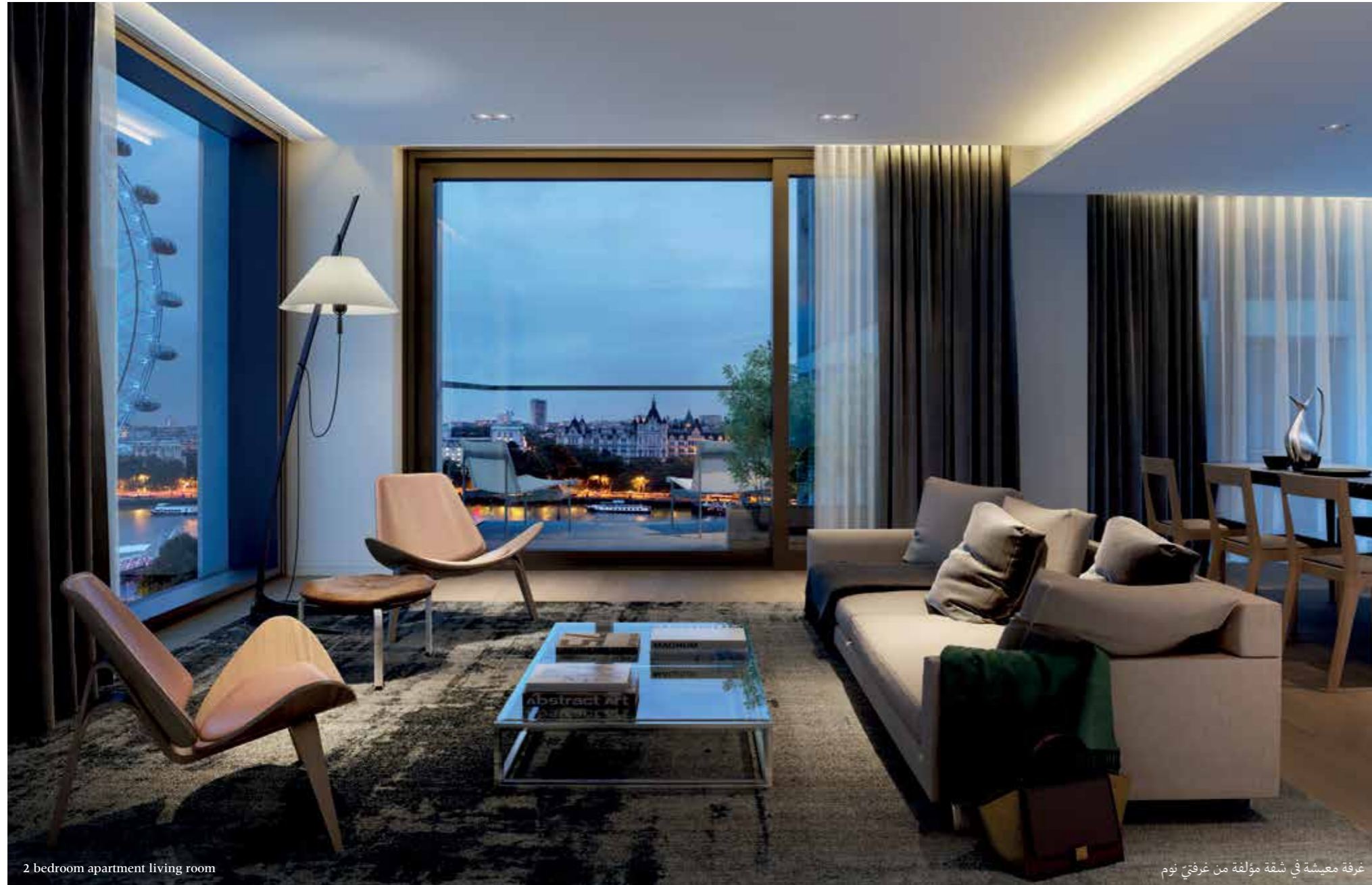
2 bedroom apartment living room