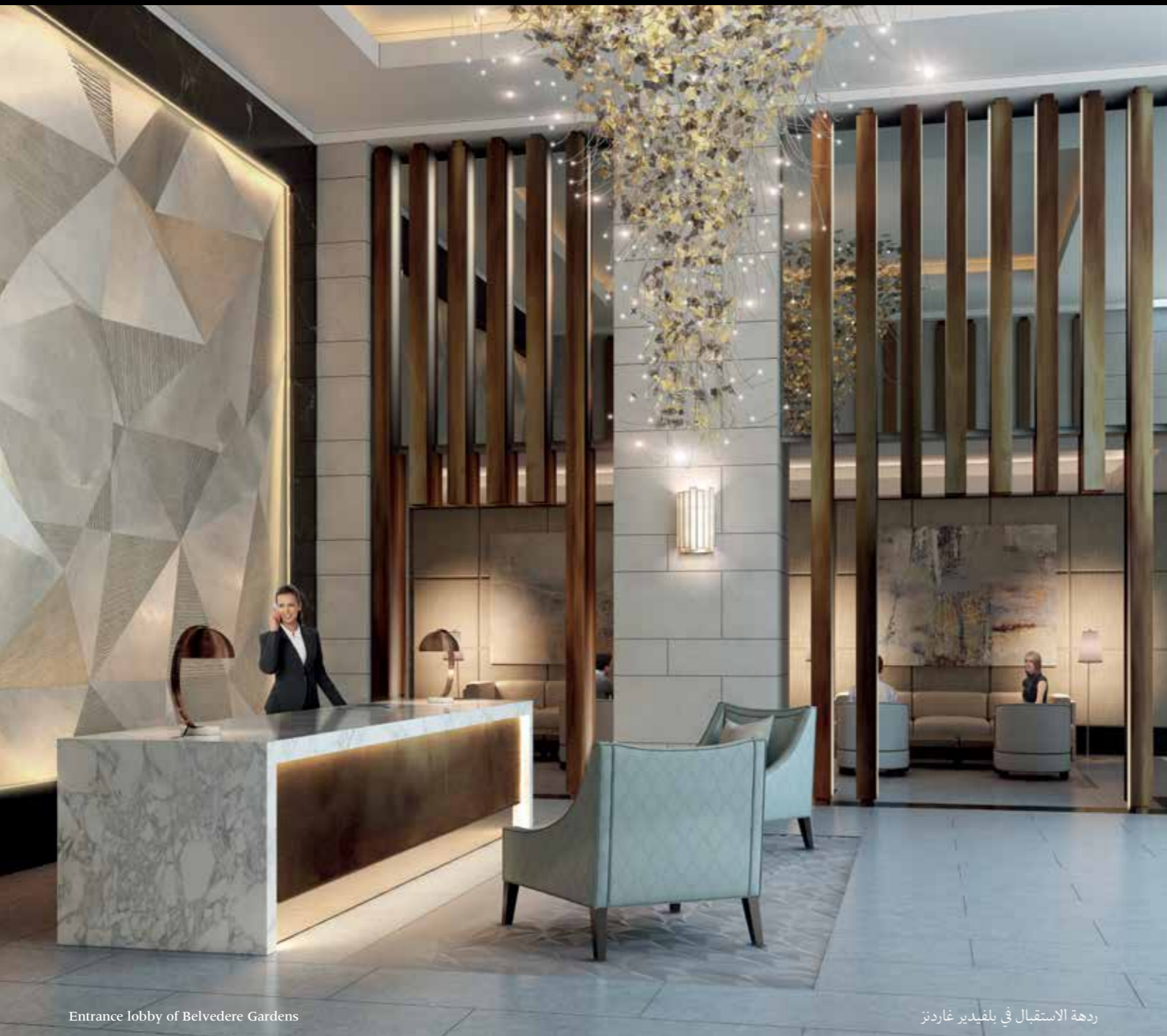
Entrance lobby of Belvedere Gardens