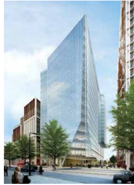
Two Southbank Place / Kohn Pedersen Fox Assoc. اثنان ساوثبنك بليس / كون بدرسون فوكس أسوسيأيتس