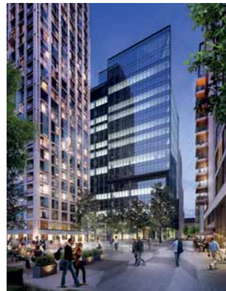
Casson Square / Townshend Landscape Architects / Squire and Partners كاسون سكوير / تاونزيند لاندسكيب آركيكتكس / سكوأير وشركاؤه

These prestigious landmark buildings, designed by five notable architects, encircle the existing landmark Shell Tower. The five stunning residential buildings provide a collection of exceptional apartments and penthouses, complemented by the highest quality restaurants, stylish bars, state-of-the-art leisure amenities and fabulous public spaces to relax in.