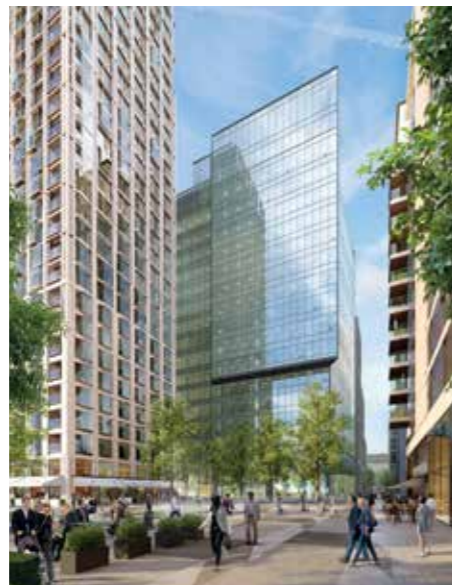
Casson Square / Townshend Landscape Architects / Squire and Partners كاسون سكوير / تاونزيند لاندسكيب آركيكتكس / سكوأير وشركاؤه