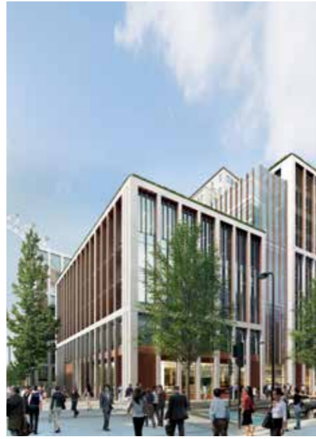
One Southbank Place / Squire and Partners واحد ساوثبنك بليس / سكوأير وشركاؤه