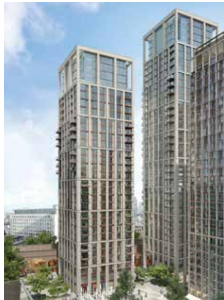
One & Thirty Casson Square / Squire and Partners واحد وثلاثون كاسون سكوير / سكوأير وشركاؤه