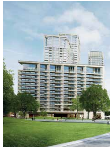
The Belvedere / Stanton Williams ذي بلفيدير / ستانتون ويليامز