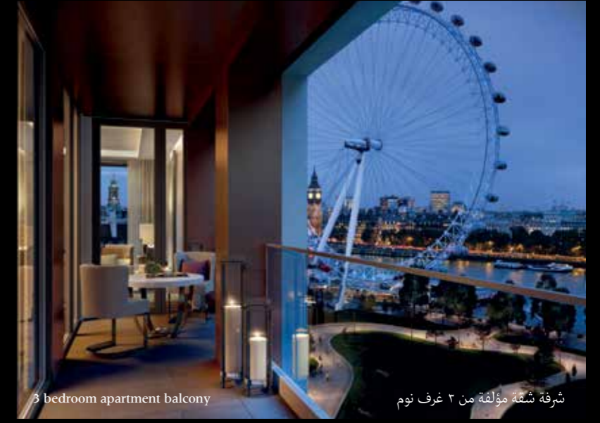
3 bedroom apartment balcony