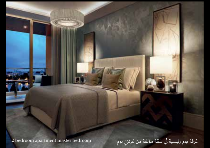
2 bedroom apartment master bedroom