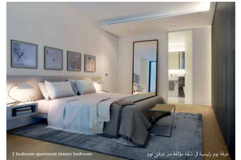
2 bedroom apartment master bedroom