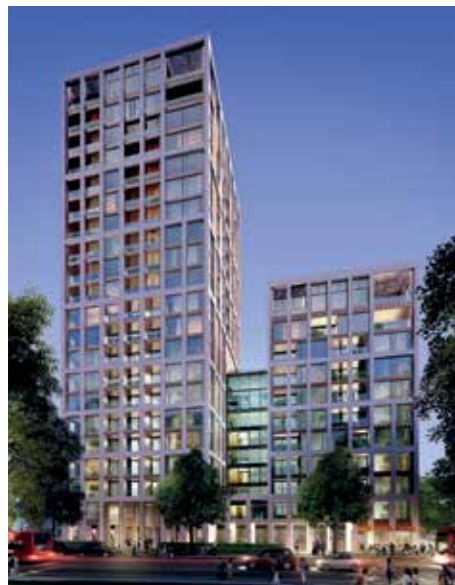
Belvedere Gardens / GRID Architects بلفيدير غاردنز / غريد للهندسة المعمارية