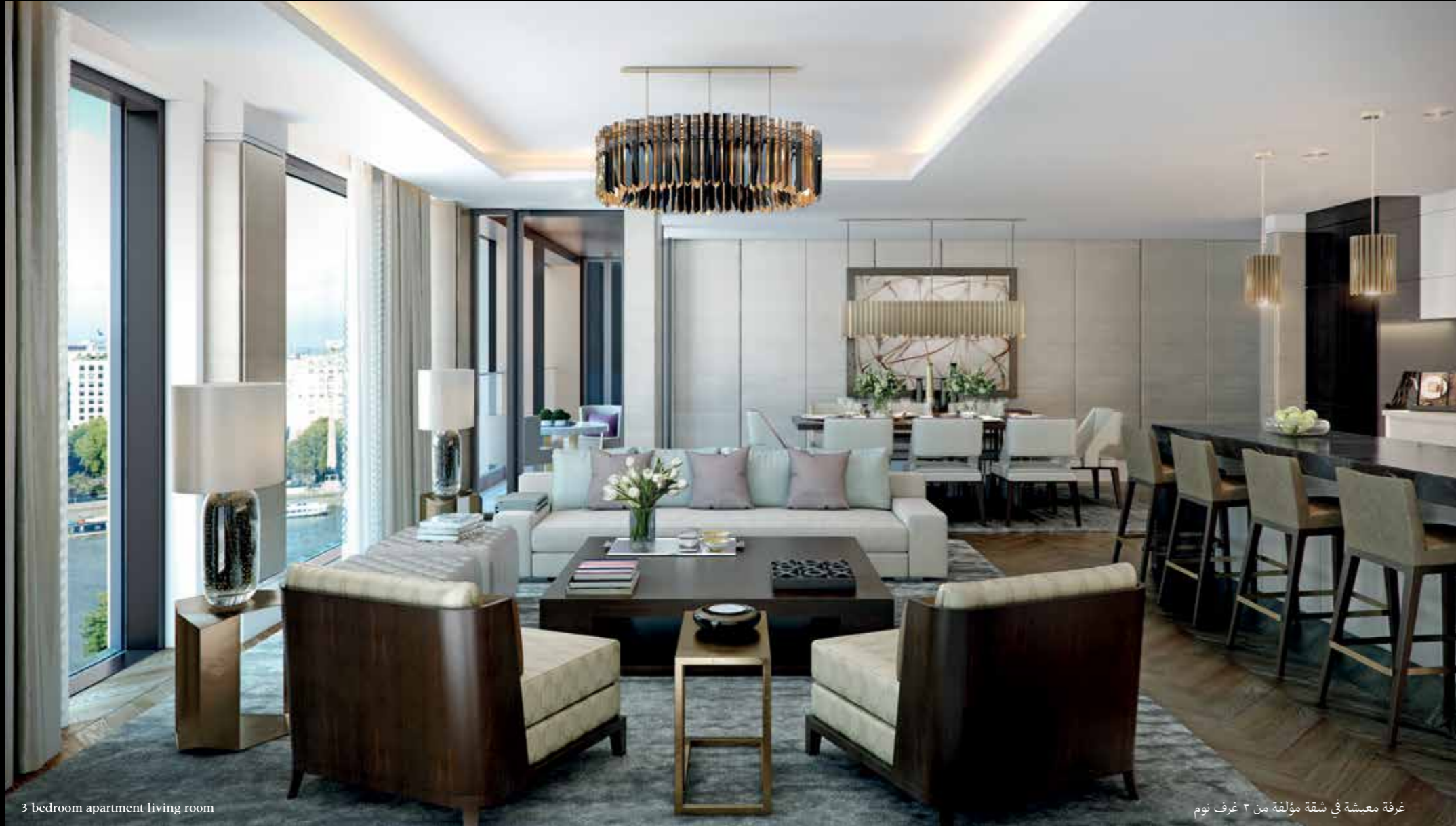
3 bedroom apartment living room