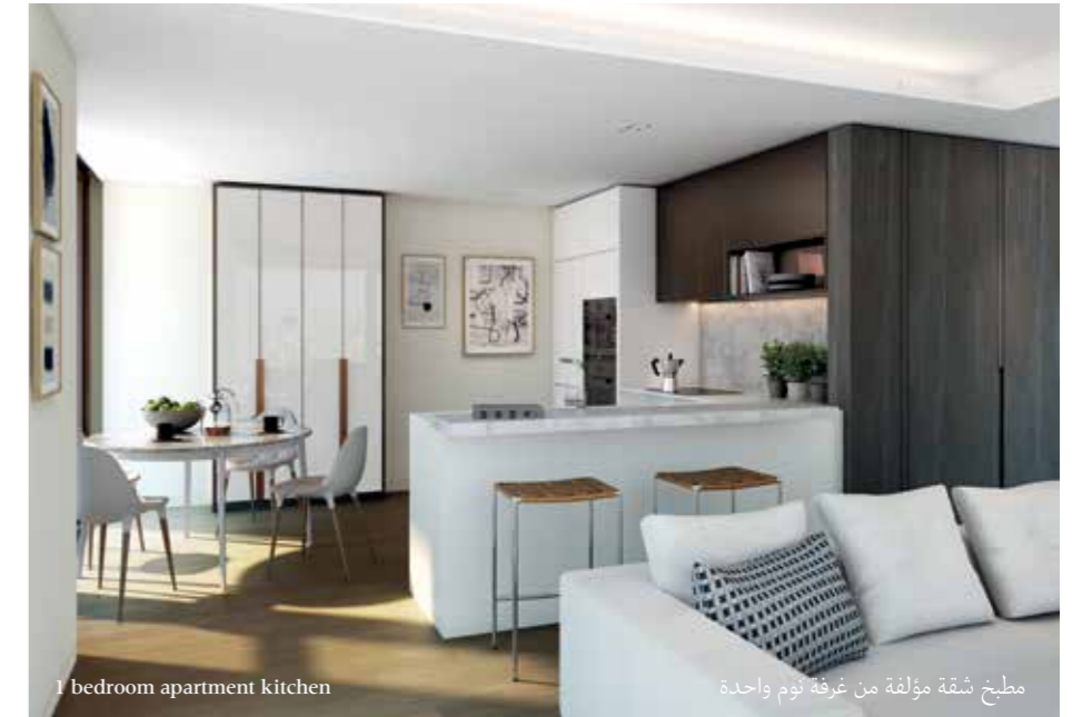
1 bedroom apartment kitchen