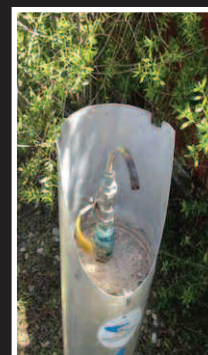
MPWD Water Quality Sampling Station