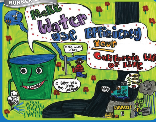
Hawkins D. / Central Elementary School / 5th Grade