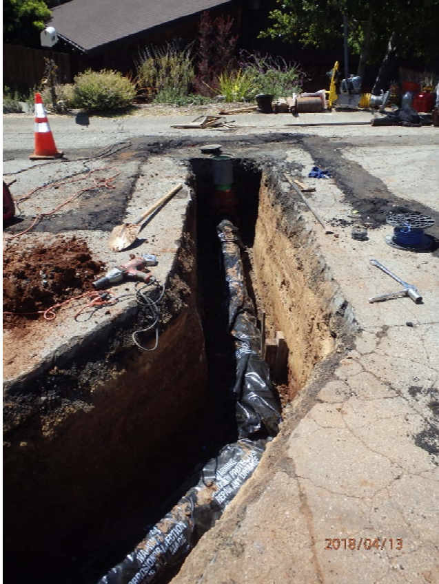
April 13, 2018 – Tie-in at ADLP (ADLP/Arthur Ave)