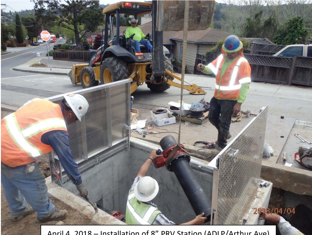
April 4, 2018 – Installation of 8" PRV Station (ADLP/Arthur Ave)