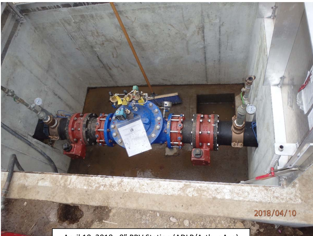
April 10, 2018 – 8" PRV Station (ADLP/Arthur Ave)