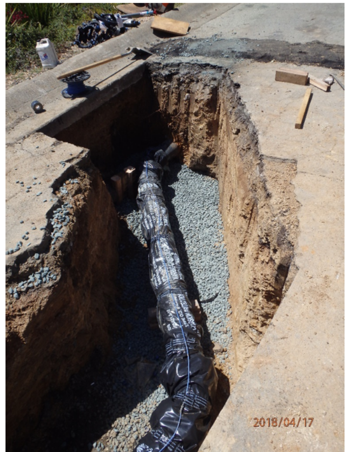
April 17, 2018 – Tie-in at Arthur Ave (Arthur Ave)