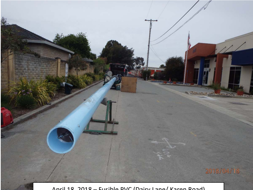
April 18, 2018 – Fusible PVC (Dairy Lane/ Karen Road)