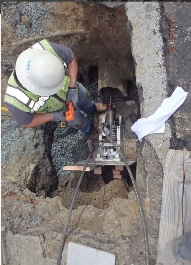
April 2018 – Pulling Fusible PVC (Dairy Lane/ Karen Road)