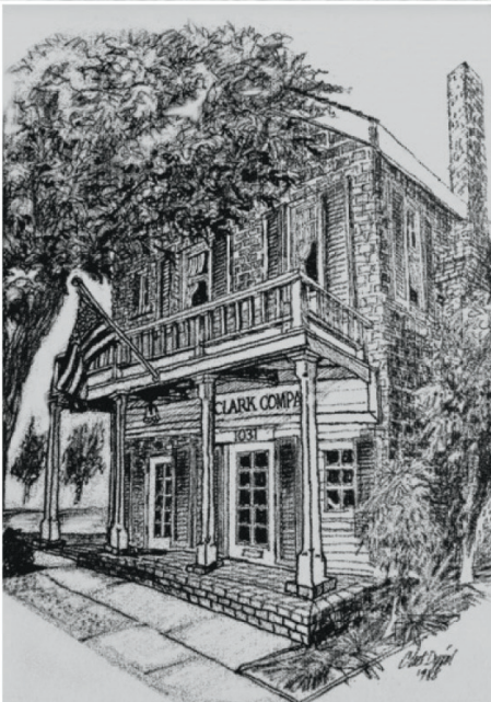
DOWNTOWN PASO ROBLES CALIFORNIA