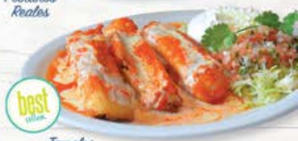
Tamales El Chilango