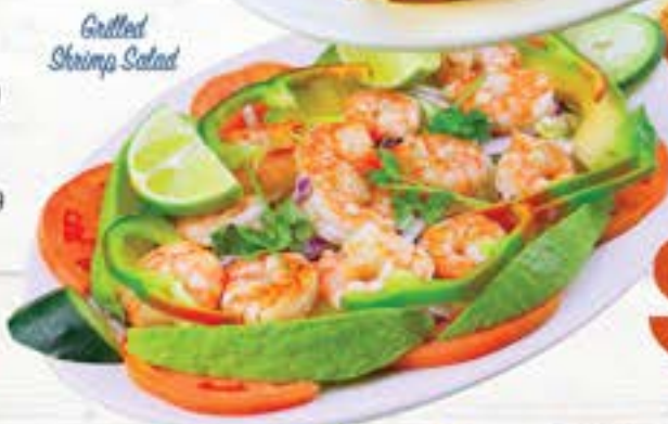
Grilled Shrimp Salad

Lettuce, tomato, onion, bell pepper, shredded cheese, topped with seasoned grilled chicken. 10.99