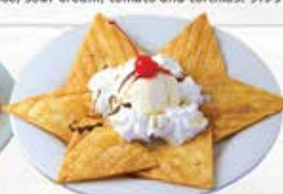
Sopapilla with Ice Cream

A flour tortilla stuffed with Hershey's chocolate deep fried to golden brown and topped with sprinkled cinnamon, strawberry topping and a scoop of ice cream. 5.99