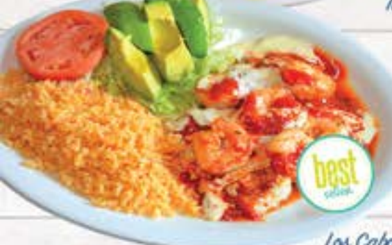
Los Cabos Special