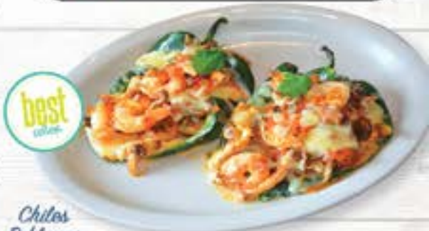
Chiles Poblanos Reales

? WHAT IS BIRRIA BEEF COOKED FOR HOURS IN ITS OWN BROTH WITH MEXICAN SPICES AND CHILIS