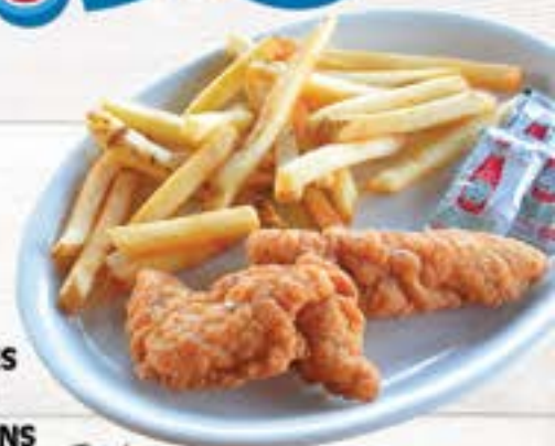
Tenders & Fries