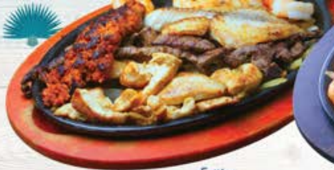
Fajitas Mar y Tierra