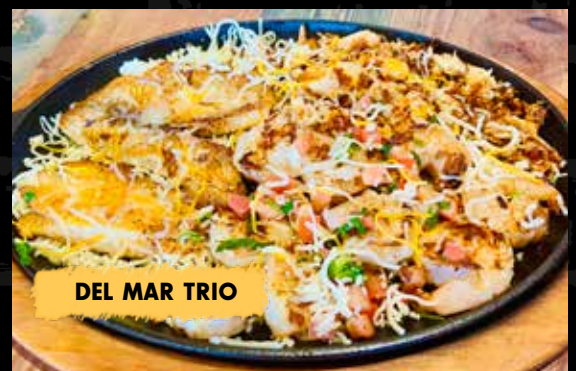
DEL MAR TRÍO