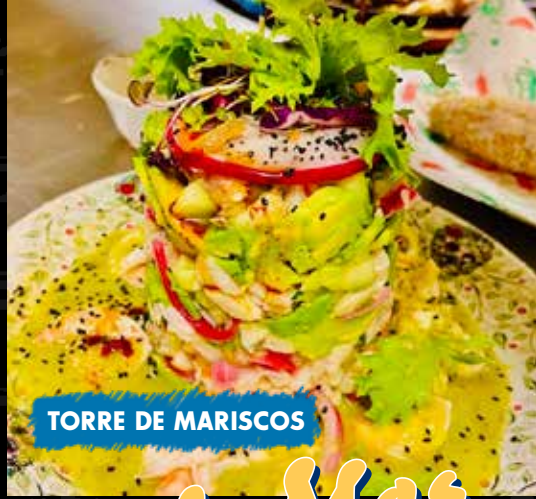
TORRE DE MARISCOS