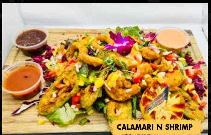
CALAMARI N SHRIMP