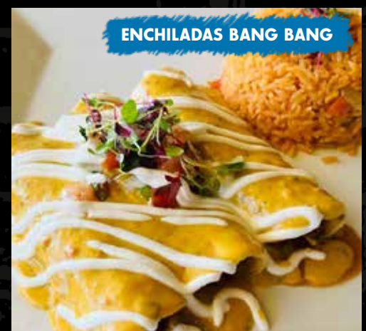
ENCHILADAS BANG BANG

Three enchiladas stuffed with chicken or ground beef topped with red salsa, cheese sauce, onion and chorizo served with rice and beans. $15.99