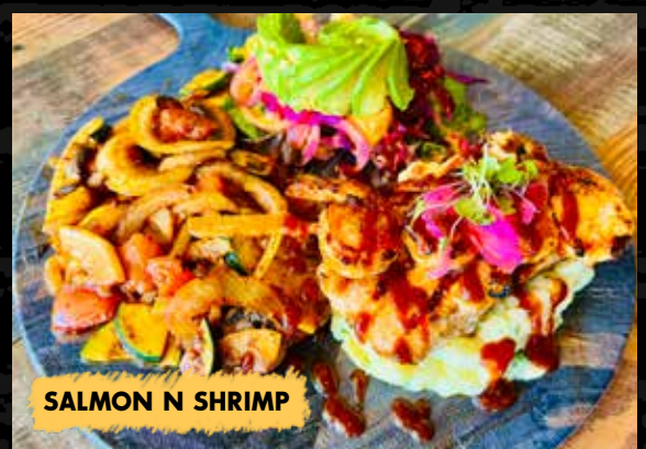
SALMON N SHRIMP