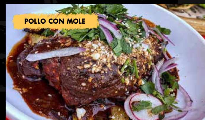
POLLO CON MOLE

Bed of rice, Topped with chicken breast, topped with bourbon bbq. Served with California vegetable and asparagus. 18.99