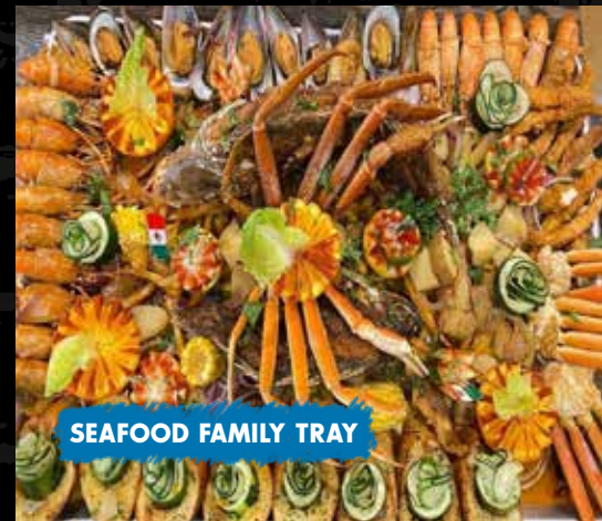
SEAFOOD FAMILY TRAY