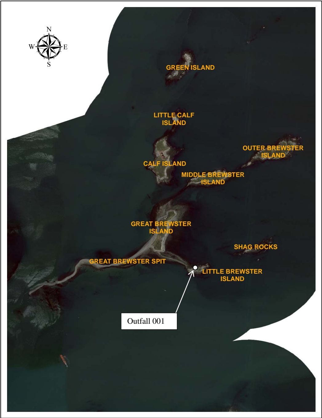
Attachment A U.S. Coast Guard Light Station Boston MA0090433 Location Map