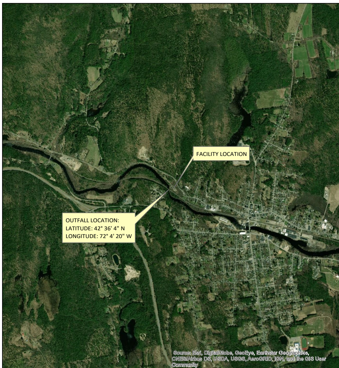
Figure 1: Location of the Orange WWTF

Scale 1 : 24,000 0 500 1,000 Meters 0 1,000 2,000 3,000 Feet Regulated Facilities: EPA