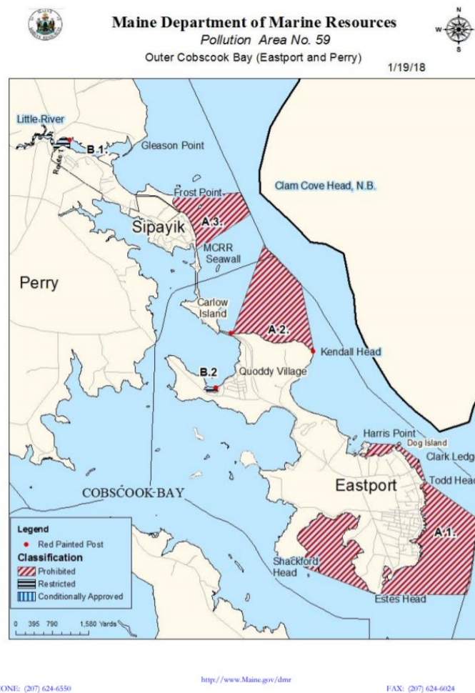
Figure 1. Shellfish Closure Area.

The waters listed are closed for shellfishing by the Maine Department of Marine Resources (MEDMR), Area 59 (See Figure 1). The few reported exceedances of the fecal coliform effluent limits from August 2013 through September 2018, show that the discharge has little effect elevated fecal coliform in the receiving water. The new year-round fecal coliform effluent limits will ensure that the discharge does not cause or contribute to an exceedance of fecal coliform levels in the receiving water during the entire year.