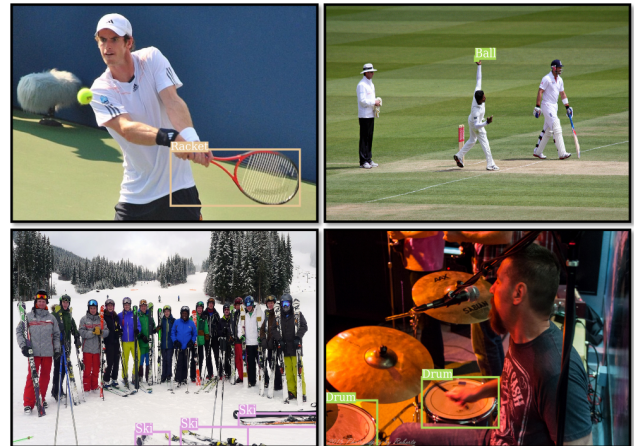
Figure 1: Example images of Open Images. There are severe missed annotations for the bounding box. In the example images, all human bounding boxes are missing.

In the era of deep learning, more training data always benefits the generalizability of model [20]. With the help of large-scale Open Images detection dataset, the frontier of object detection would be pushed forward a