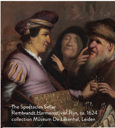
The Spectacles Seller Rembrandt Harmensz. van Rijn, ca. 1624 collection Múseum De Lakenhal, Leiden