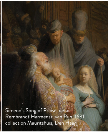
Simeon's Song of Praise, detail Rembrandt Harmensz. van Rijn, 1631 collection Mauritshuis, Den Haag