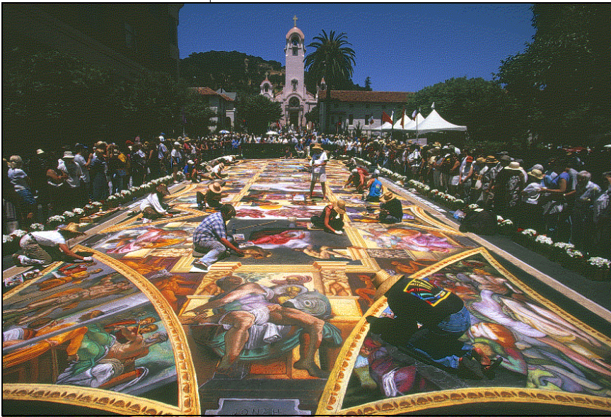
Artists from as far away as Italy re-created the Sistine Chapel ceiling at the 10th annual Youth In Arts Festival.

CA-1c. Partnerships. Encourage arts groups, schools and businesses to conduct programs in City venues.