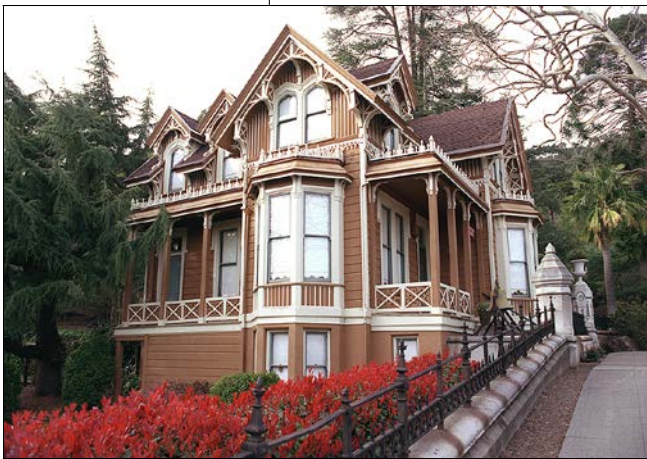
The Boyd Gatehouse currently houses the Marin History Museum, which began construction of a new facility in 2005.

City policy has been to protect and build upon the historic character that exists in the City. The City adopted a Historic Preservation Ordinance in 1978. The ordinance established guidelines regarding remodeling or demolishing historic buildings. The ordinance is implemented by the Design Review Board and Planning Commission. See Exhibit 24 for a list of historical landmarks in San Rafael.