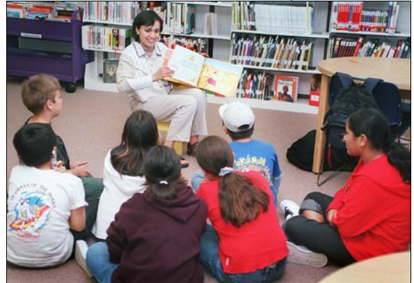
San Rafael children enjoy the library's reading programs.

Resources: Staff Time, Bonds, Grants, Tax, Donations