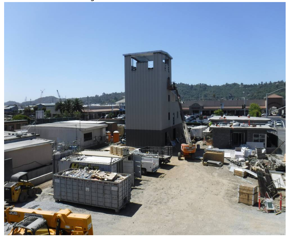
June 2018 progress pictures for Fire Station 52

During the month of June, Alten Construction completed MEP and fire protection roughin at the Fire Station building. Framing activity continued on the 1<sup>st</sup> and 2<sup>nd</sup> floors as well. At the Classroom building, insulation, drywall and exterior plater were completed. TPO roofing and flashing were substantially completed as well. Site CMU was completed as was erection of the Training Tower.