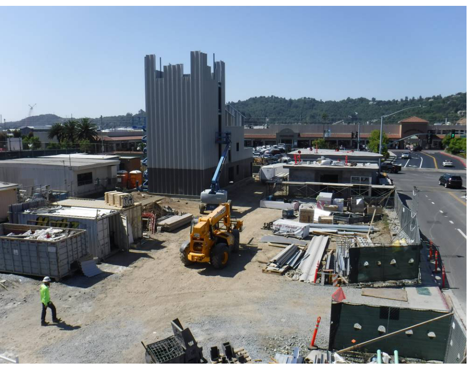
June 2018 progress pictures for Fire Station 52