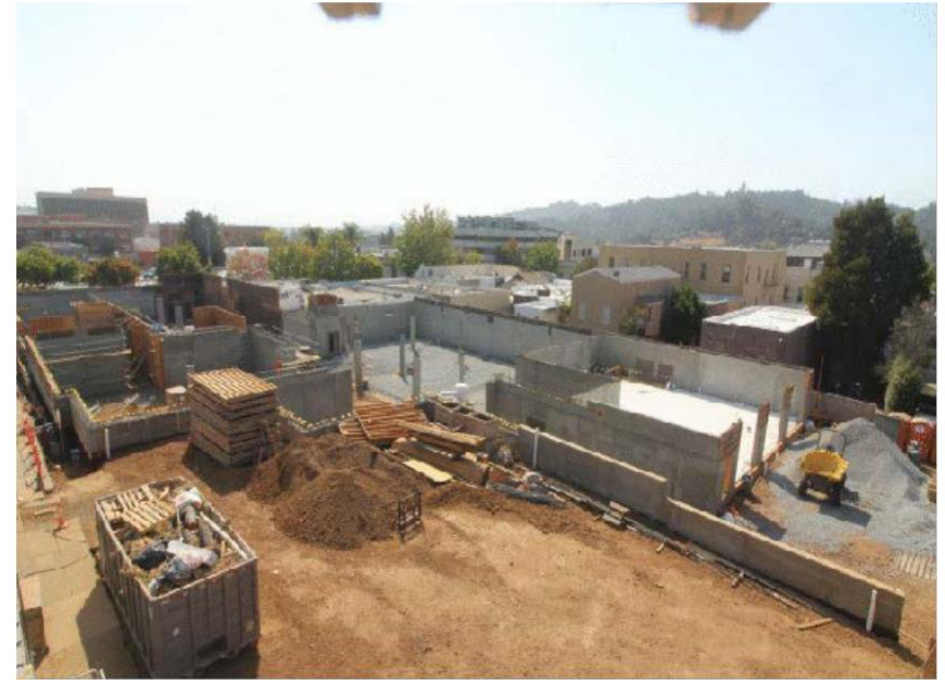
August progress picture – Overview of project site progress.