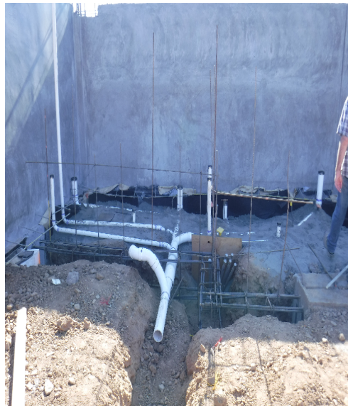
August progress picture – Under Slab Utilities (Storm Drain and Sewer)