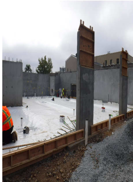
August progress pictures – Under Slab rock and water proofing at the basement and App. Bay