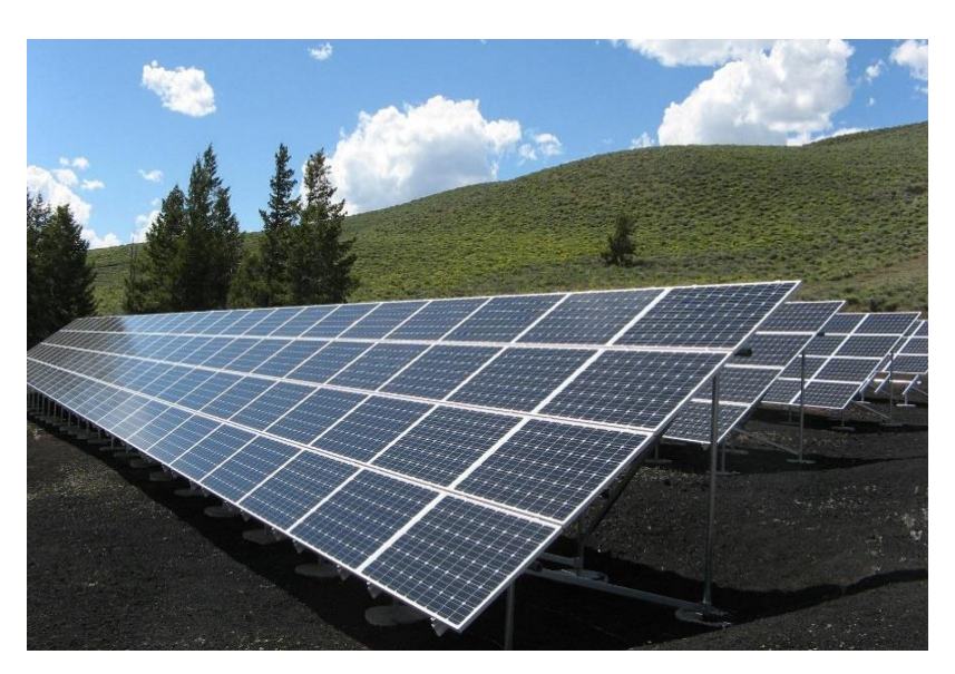
In Marin, much of our electricity is generated from renewable sources such as solar and wind, making electricity a cleaner alternative to natural gas and propane.

Natural gas use in homes impacts indoor air quality and presents a risk of gas leaks and combustion-related injury. Burning gas in enclosed spaces can result in unhealthy levels of nitrogen dioxide, carbon monoxide, and formaldehyde. While exhaust systems can help, switching to electric appliances will remove the sources of these emissions entirely. Cooking with natural gas has also recently been found to be a cause of childhood asthma. Leaks are a pervasive problem with gas infrastructure, which can be especially dangerous in earthquake and fireprone areas such as ours. For more information about these and other health and safety risks associated with natural gas use, visit the Resources and Links section of the Electrify Marin website at <a href="https://www.marincounty.org/electrify">www.marincounty.org/electrify</a>.