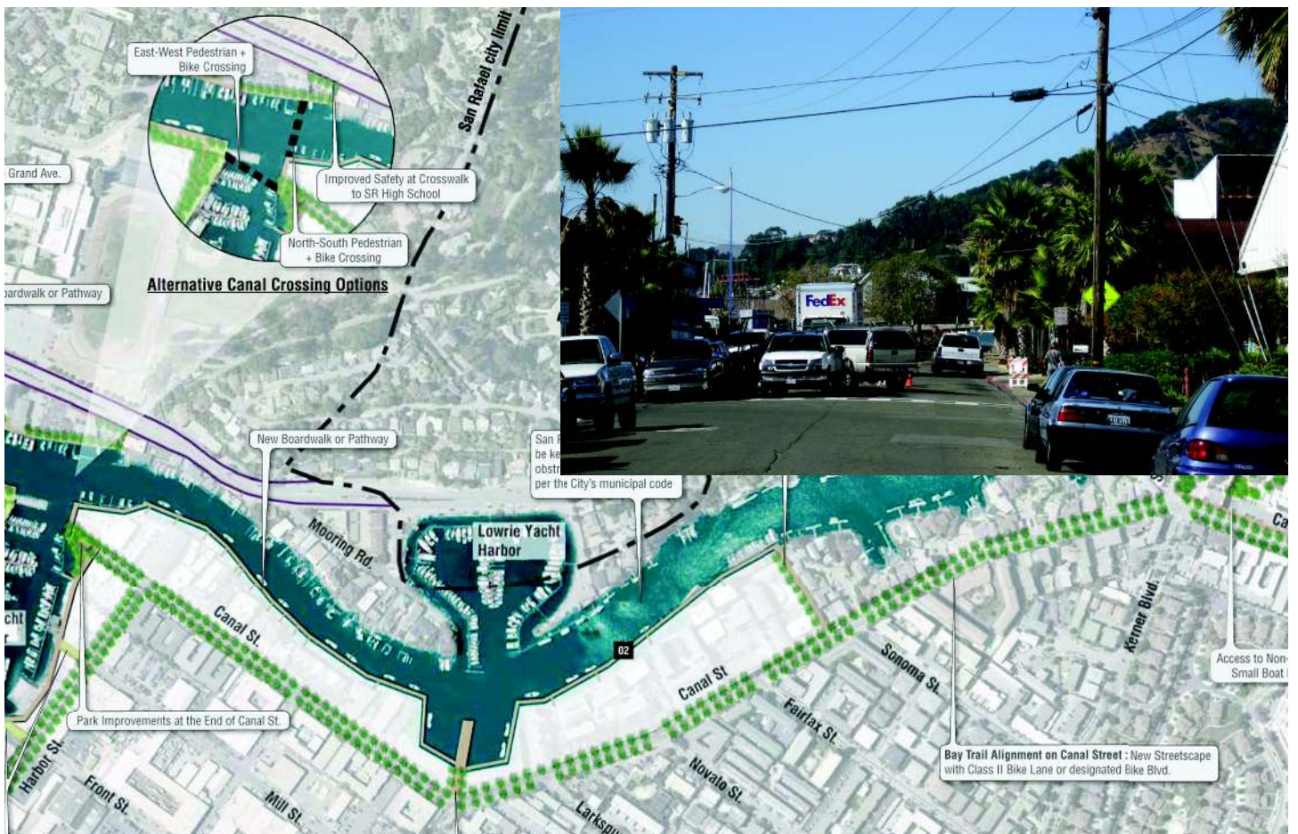
Enlargement of the Canal Street Area