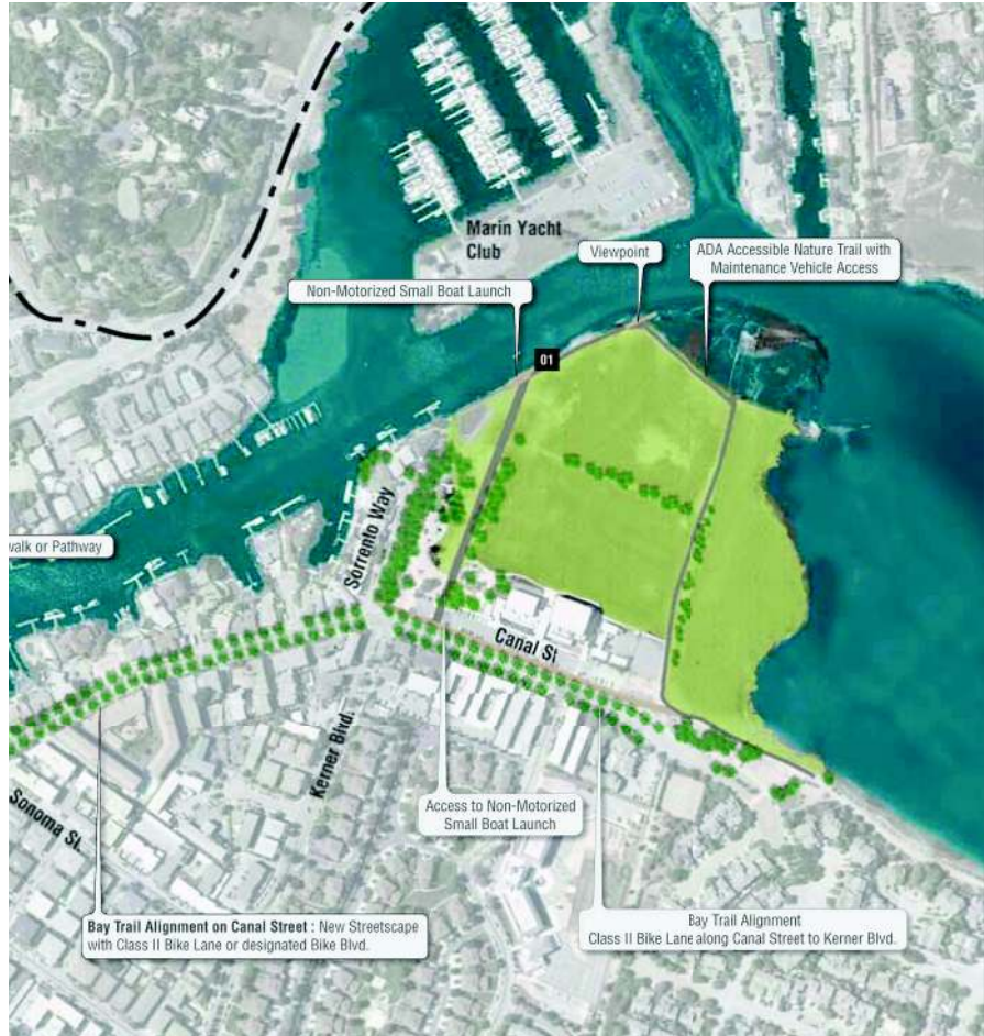
Enlargement of Pickleweed Park