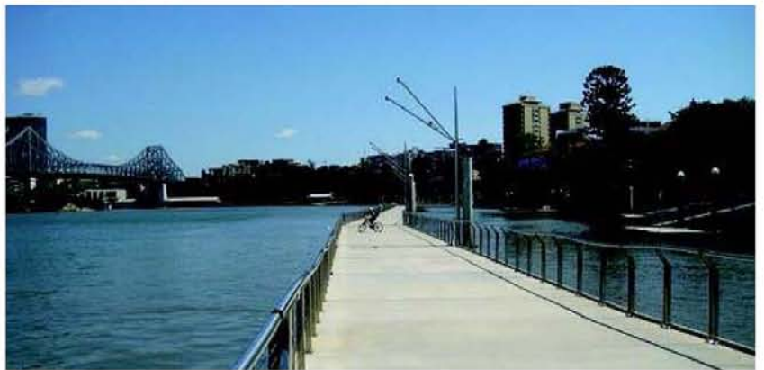
Waterfront pathways and pedestrian bridges