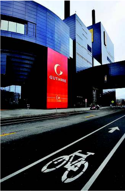
Class II bike lane