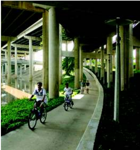
Art and lighting under highway