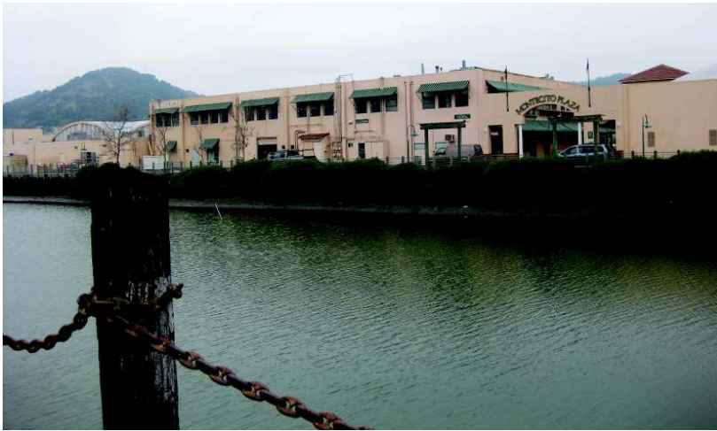
Montecito Shopping Center

Street, Mill Street and Front Street at Harbor Way. T