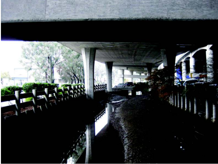
Existing Conditions; Enlargement of the Transit Center Area