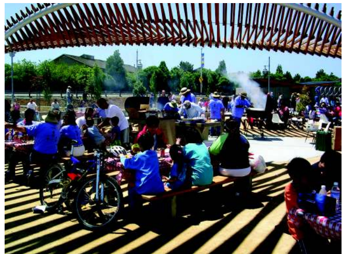
Group picnic area