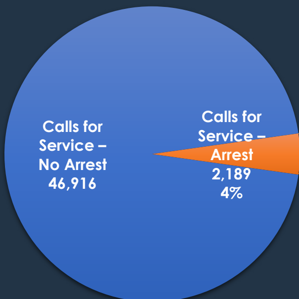
Calls for Service Resulting in an Arrest

3% of arrest reports required use of force