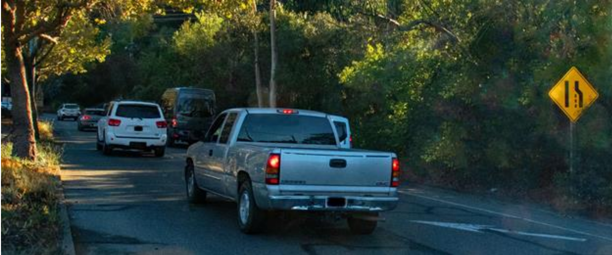
Road narrowing at eastbound East Blithedale Avenue approaching Highway 101.

The problem is compounded when evacuation routes cross multiple jurisdictions where no single agency has authority to make improvements along the entire route. These problems are illustrated at several locations in Marin.