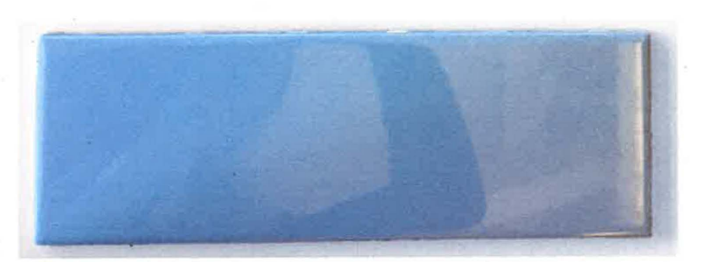
TL - 1