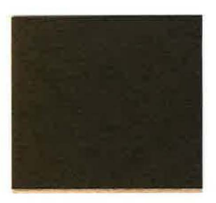
MT - 1