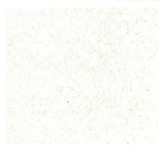
PL - 1

METAL SIGNAGE ON PLASTER WALL: SIN-1 SOLID FENCE - PLASTER FINISH: PL- 1 METAL PICKET FENCE AND GATE: MT - 1