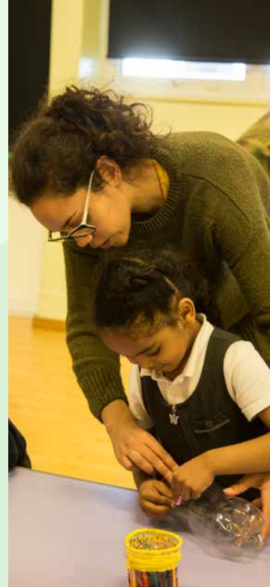
Beyond Face Schools Workshop Beyond Face working with Prince Rock School as part of their Coxside project

Whether it is to support via a longer term and partnership approach or one off advice, guidance and project development, we are confident and highly committed to good quality outcomes that are sustainable and built on relevant and tested approaches.