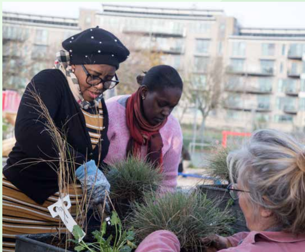
Thrussells Community Planter, Coxside Planting up the new community planter

Our work has been case-studied and platformed by Arts Council England, Engage, Artwork Alliance, Gulbenkian Foundation, The Centre for Cultural Value, Co:Vi, UCL Press, Routledge, Birkbeck University and University of the Arts London.