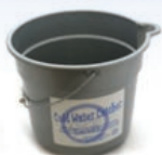
Cold Water Catcher Bucket