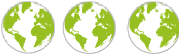
Figure 2: The 'three planet problem'

If everyone on earth consumed resources at the same rate as western Europeans, we would need three planet earths to support humanity. Rooted in the science and metrics of ecological and carbon footprinting, One Planet Living is a vision of a world in which people enjoy happy, healthy lives within their fair share of the earth's resources, leaving space for wildlife and wilderness.