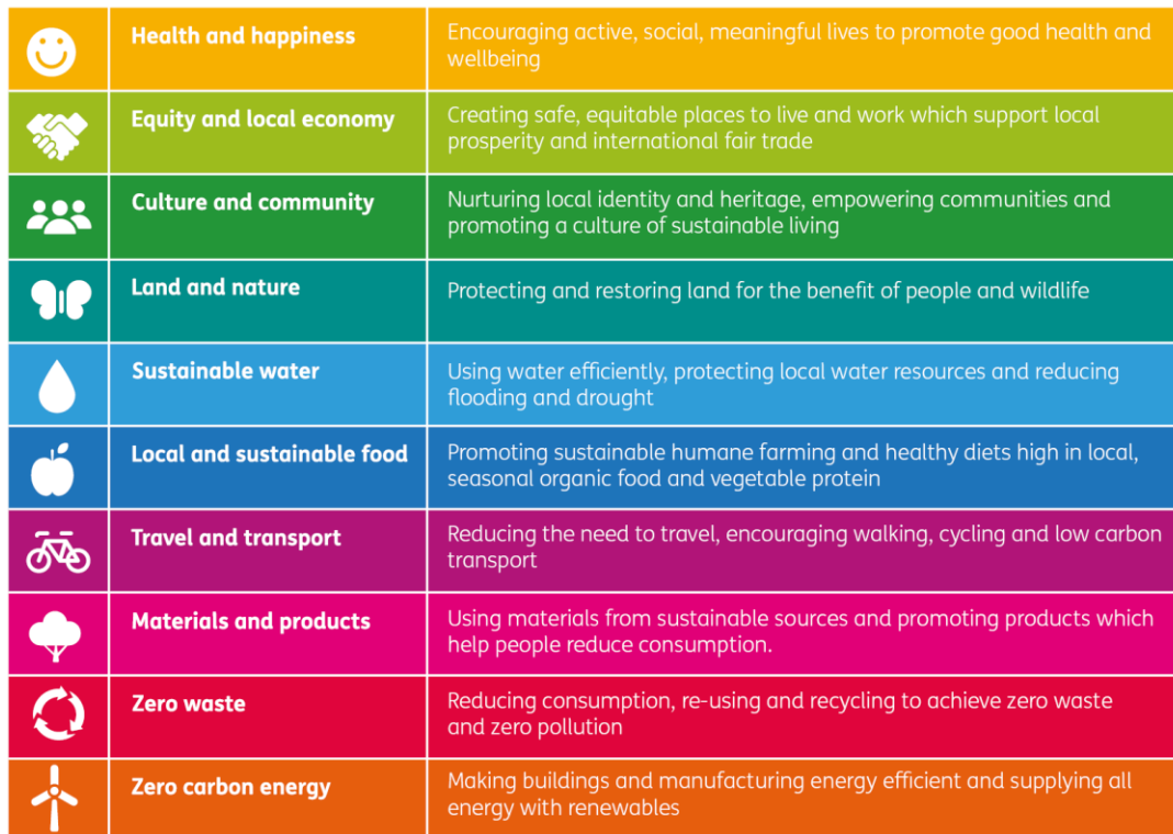
Figure 1: The 10 One Planet Principles

One Planet Living is a simple framework which enables everyone – from the general public to professionals – to collaborate on a sustainability strategy drawing on everyone's insights, skills and experience. It is based on ten guiding principles of sustainability which we can use to create holistic, joined-up solutions: