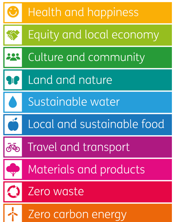
The ten principles of One Planet Living

Singita Serengeti's performance in wildlife conservation and community outreach remains