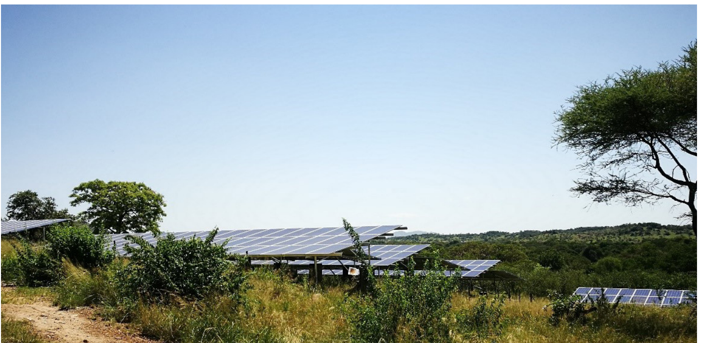
189kWp of photovoltaic panels nestled into the landscape at Faru Faru