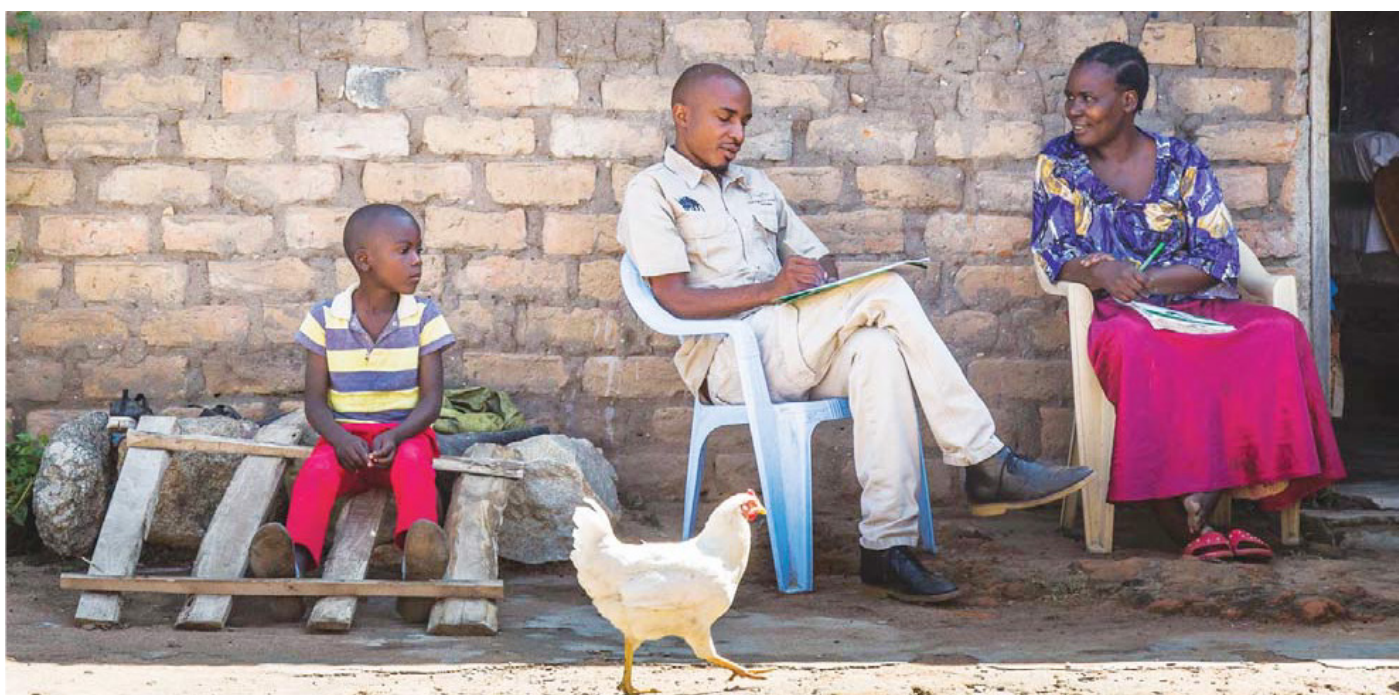
An enterprise development officer meets with a local entrepreneur