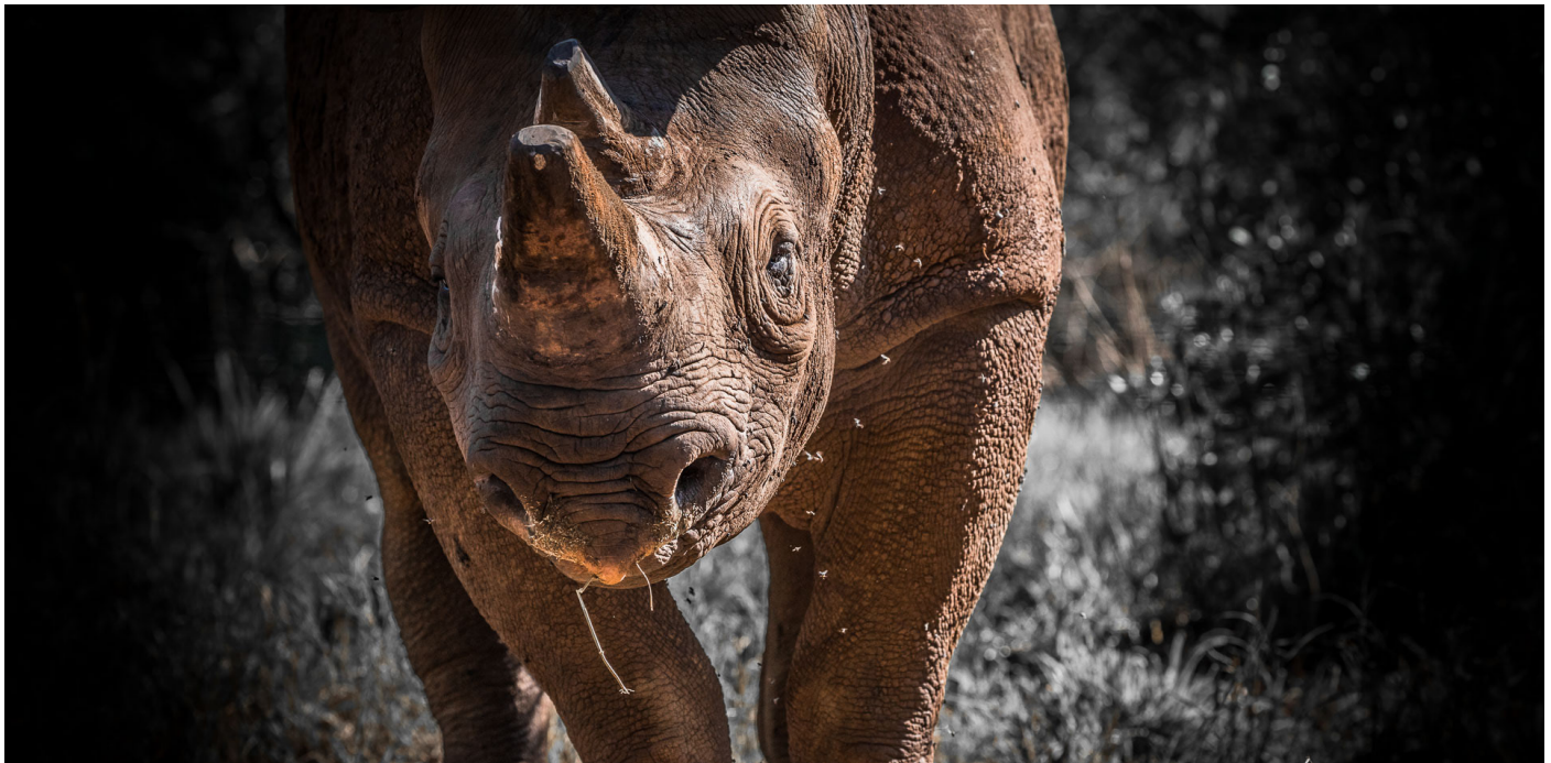
Eric, a critically endangered black rhino, has been re-homed at Singita Serengeti