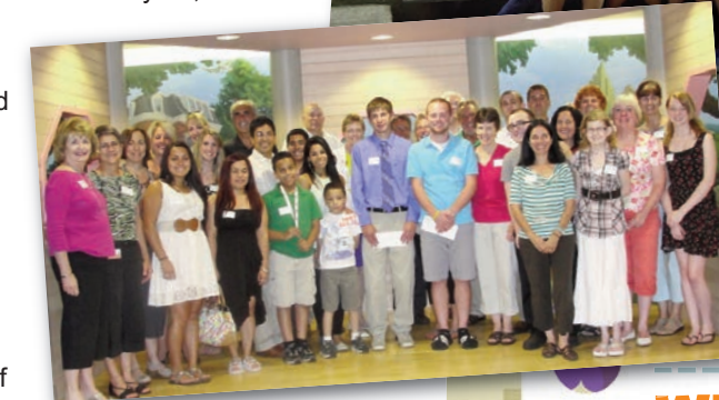
Kids receive Dino Germani College Scholarships

Each year current and former Tomorrow Fund patients who qualify are awarded a Dino Germani Scholarship to assist with the costs of college education. We are pleased to be part of this assistance, which is a stepping stone to our "kids" future. To date, 93 scholarships have been awarded.