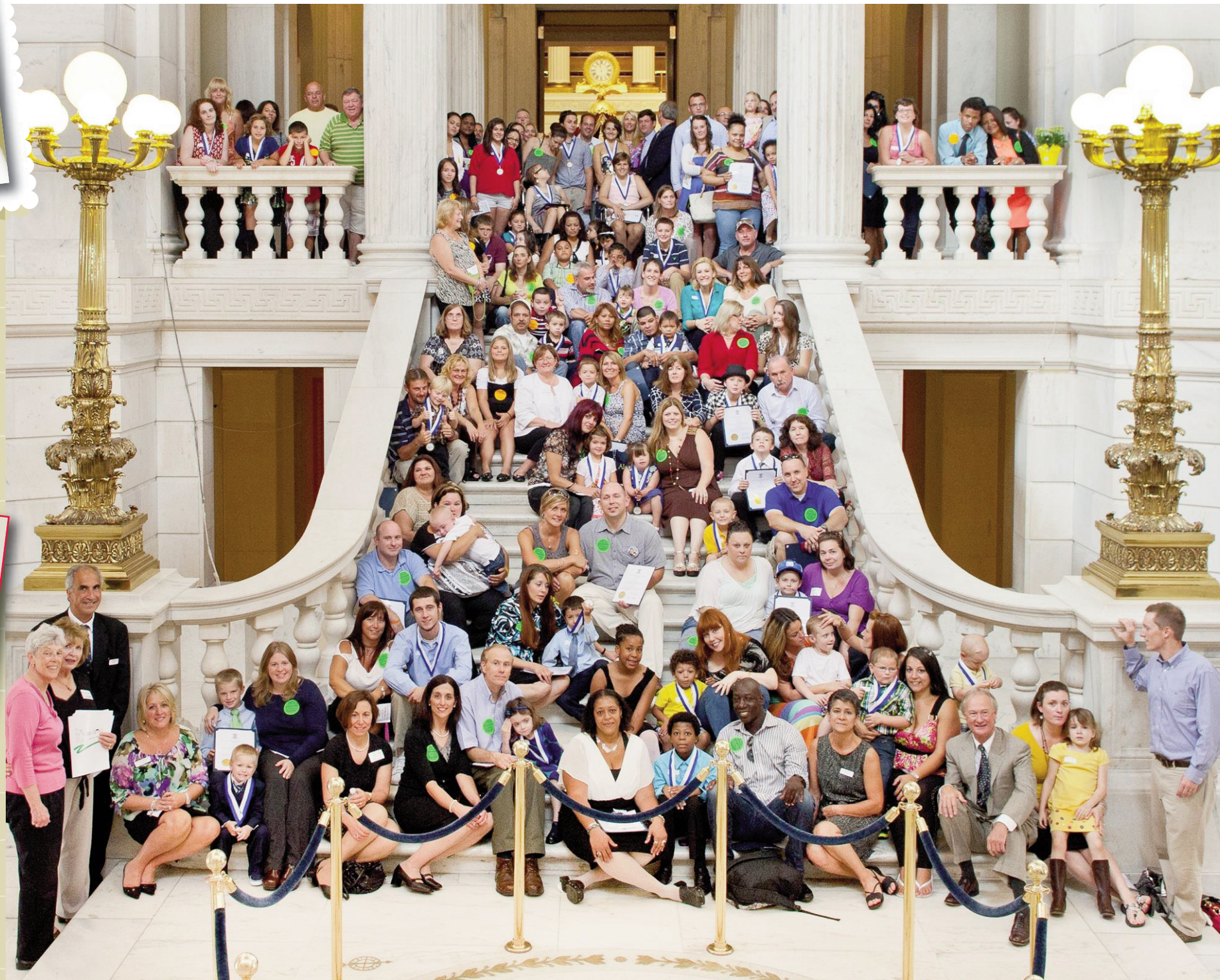
2013 Childhood Cancer Awareness Governor's Reception at the State House