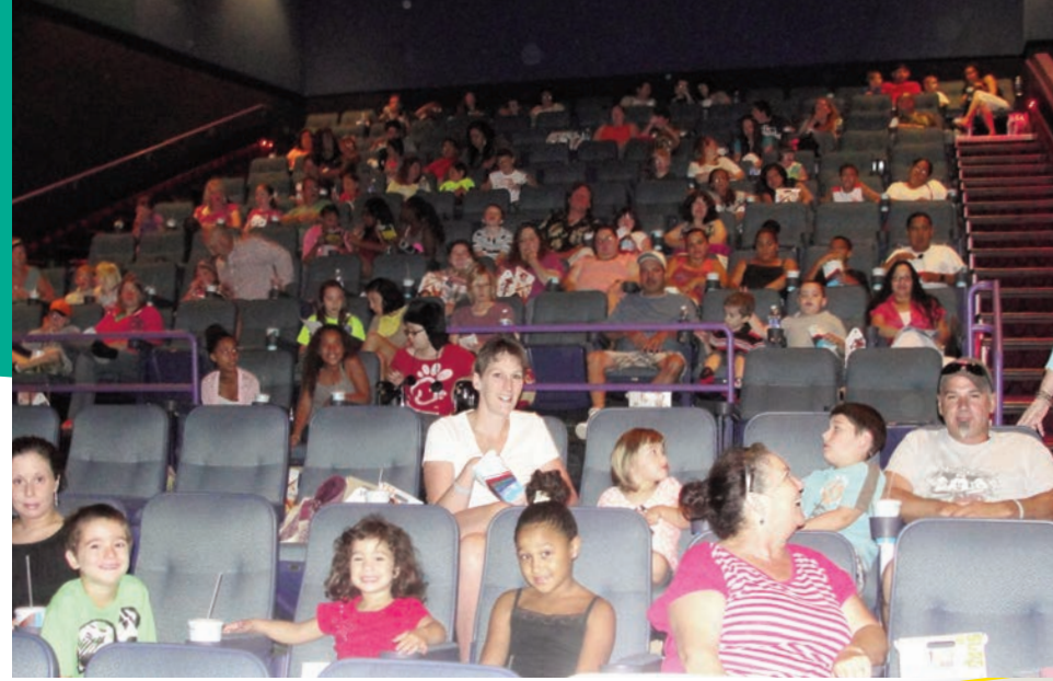
Our first TTF Family Fun Movie Day