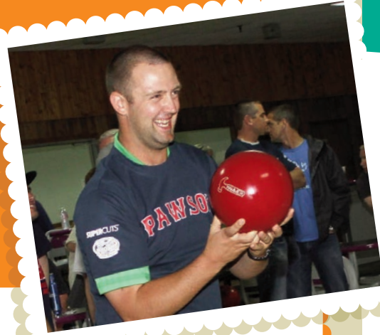
The Pawtucket Red Sox hosted their 4th Annual "STRIKE OUT CANCER" Bowling event. This year's event raised $3,000!