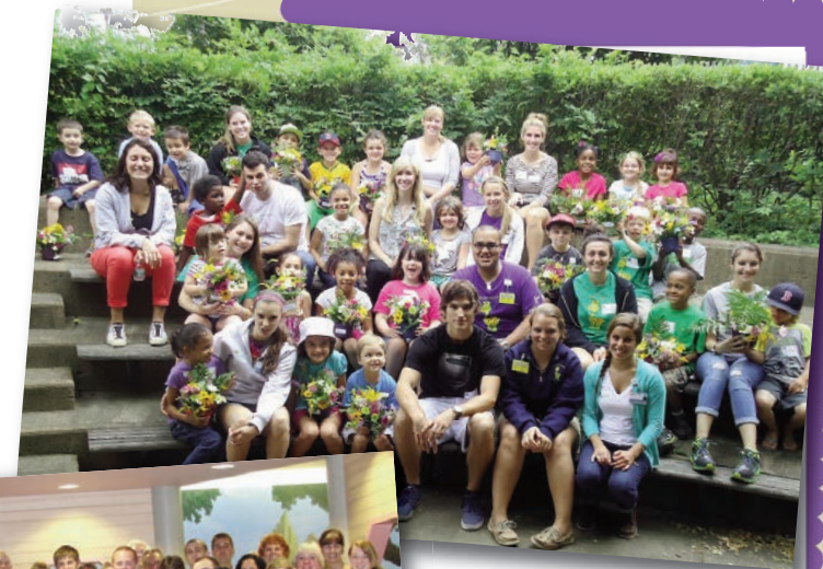
Camp Dotty 2013

Camp Dotty, a day camp for 4-7 year old children with cancer and their siblings, was created to provide a camp experience for young children while recognizing their individual needs as they deal with cancer. The camp helps to create a transition for those children not old enough to attend an overnight camp while simply and importantly giving parents a much needed break. Last year, for the 13th consecutive year, more than 30 children with cancer and their siblings, had a respite from their usual hospital routine. They enjoyed a full week of crafts, games, field trips and summertime fun at camp.