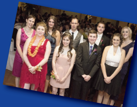
TTF Teens

We would like to thank the 43 sponsors, enthusiastic Fantasy Ball Committee and all the volunteers whose support was invaluable to the success of our celebration.