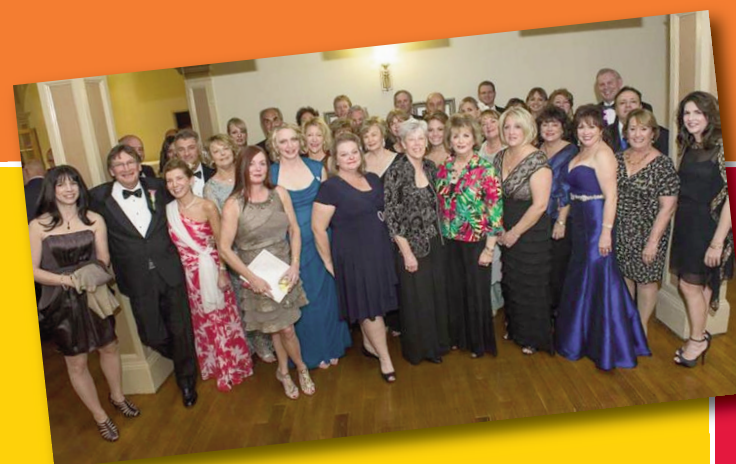
Fantasy Ball Committee