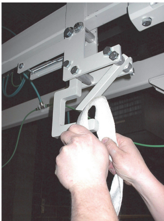
Safe, Easy Loading Bag Loop Hook Assemblies