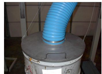
Box/Drum Filling Attachments