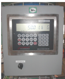
Digital Scale Control System

Rugged scale decks meet NTEP Conformance Standards and are built to withstand tough, industrial applications.