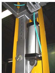
Rugged, Easily Adjusted Carriage