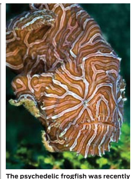
discovered in Ambon Bay.

The island of Nusa Laut has beautiful corals and excellent reef life — a tribute