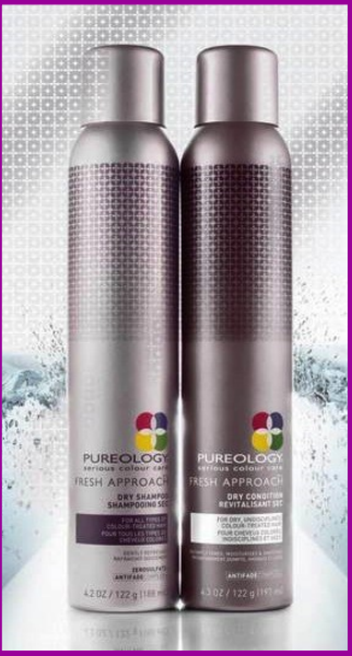
Pureology Fresh Approach Dry Shampoo and Conditioner

Redken Hair Cleansing Cream and Pureology Purify Shampoo are the two that I highly recommend using. Both are great for color treated hair and will help in not fading the color. You can and should follow up with a conditioning treatment to put moisture and protein back into your hair .