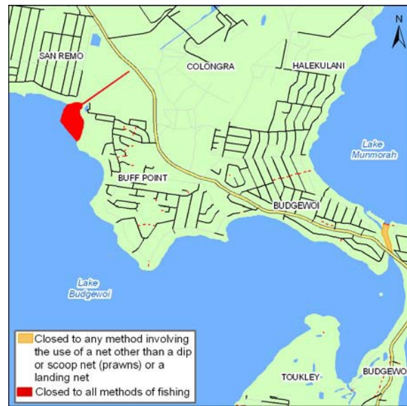
Figure 1. Budgewoi Lake and Lake Munmorah

Upper Hawkesbury River (Figure 2). All waters of the Hawkesbury River, its creeks, tributaries and inlets, upstream to its source from the road bridge at Windsor are closed to nets of every description, except the landing net.