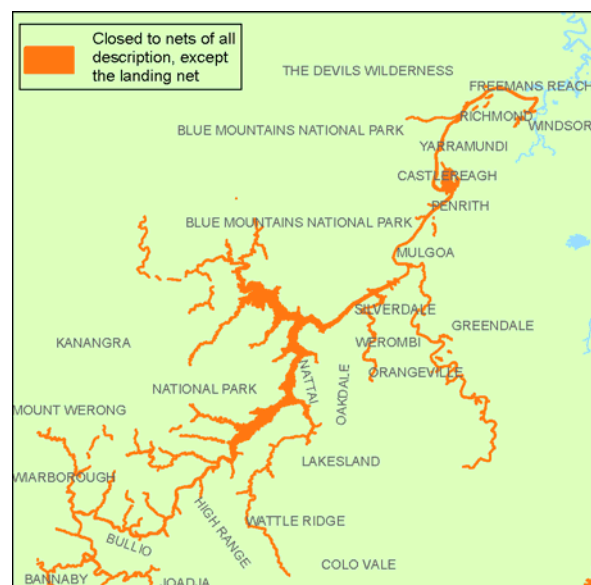
Figure 2. Upper Hawkesbury River

Brisbane Water and a portion of Broken Bay (Figure 3). The area enclosed by a line from Little Box Head to Green Point, is permanently closed to the use of all nets and traps (except the dip or scoop net, lobster trap, landing net and bait trap).