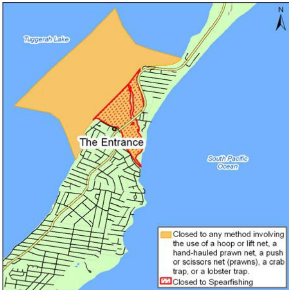
Figure 4. Tuggerah Lake

Navigation Aid Number 094), then northerly to 33°18.934'S, 151°29.875'E (NSW Maritime Navigation Aid Number 093), then south-westerly to 33°19.225'S, 151°29.589'E (NSW Maritime Navigation Aid Number 092), then south-westerly to 33°19.636'S, 151°29.134'E (NSW Maritime Navigation Aid Number 091), then south-westerly to 33°20.055'S, 151°28.708'E (NSW Maritime Navigation Aid Number 090), then easterly to 33°20.138'S, 151°29.122'E (NSW Maritime Navigation Aid Number 089), then south-easterly to 33°20.220'S, 151°29.235'E (NSW Maritime Navigation Aid Number 088), then south-easterly to 33°20.364'S, 151°29.300'E (NSW Maritime Navigation Aid Number 087), then south-easterly to a point on the high water mark of the eastern shore of that lake 805 m southerly from the northern extremity of Picnic Point.