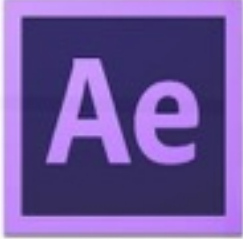
ADOBE After Effects