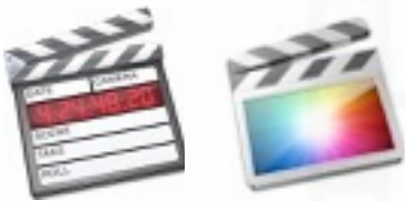
Final Cut Pro 7 & X Studio