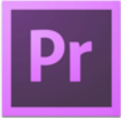
ADOBE Premiere Pro