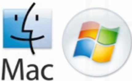
Mac & PC Trained