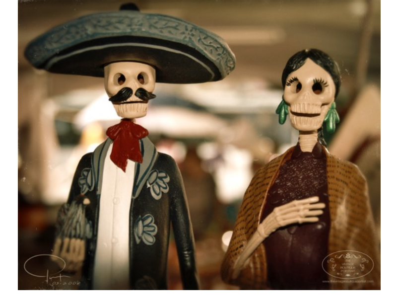
•Lo Mejor de "Nuestra Gente" Magazine, Uruapan, Michoacan - Mexico, 9th Edition / August 2007 (Front page and 2 pages about the

Collective Art Exhibition in New York, USA 2007).