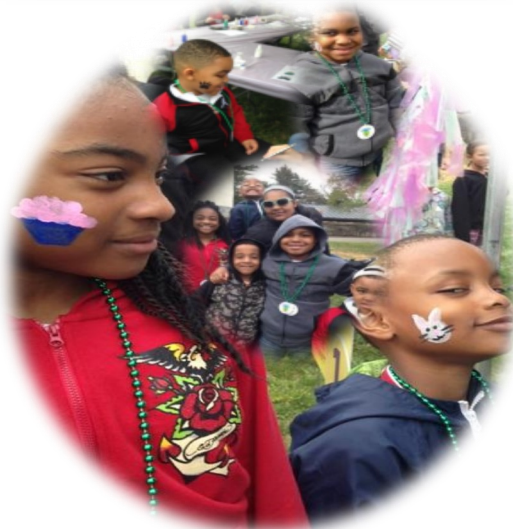
Youth Outing at Maymount Park