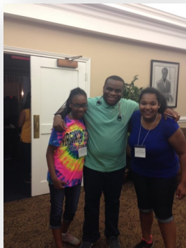
Pastor and youth at BGC youth retreat

Mount Oni has had the opportunity to participate in various educational outlets this year beginning with the Annual Church Leadership Conference in March at Virginia Union University, then the Baptist General Convention of Virginia Annual Session in June in Chesapeake, Virginia, and the Mattaponi Annual Session in Milford, Virginia at St. John Baptist Church. Even the youth had the opportunity to go to the Baptist General Convention youth retreat on the campus of Virginia State University in July. Christian Education is the cornerstone of the church, and Mount Oni wants to make sure they are adequately equipped to do all that God has called the church to do.