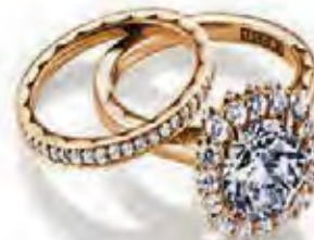
Part of the Pretty in Pink collection engagement ring: $3,680–$4,460 (not including center diamond)

Rose gold found its way into everlasting love last year, and there's no sign of it disappearing. Two-toned rings are both unique and beautiful.