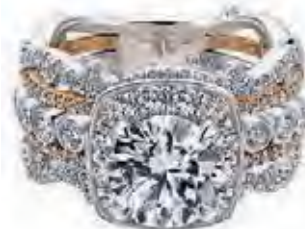
Gabriel & Co. diamond free-form engagement ring: $4,280

Double or triple bands signify that your love is unbreakable.