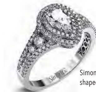
Simon G. Passion collection pear-shaped engagement ring: $3,190

A pear-shaped stone perched on her finger will be a timeless symbol of your love.