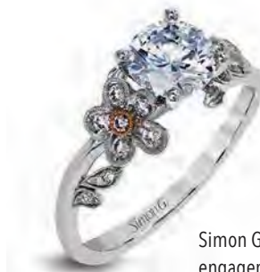
Simon G. Garden collection engagement ring: $1,870

Let your romance bloom with dainty, floral accents.