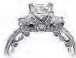
Verragio princess cut engagement ring: $6,050

Utility meets fashion with rings that have built-in spin protection to keep them in place and add more detail to the inner face.